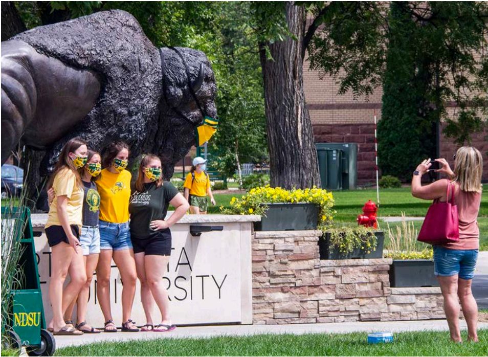
A new semester begins, September 2020.