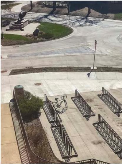
Deserted NDSU campus, April 2020.