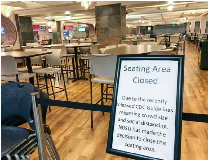
Closed food court, April 2020.