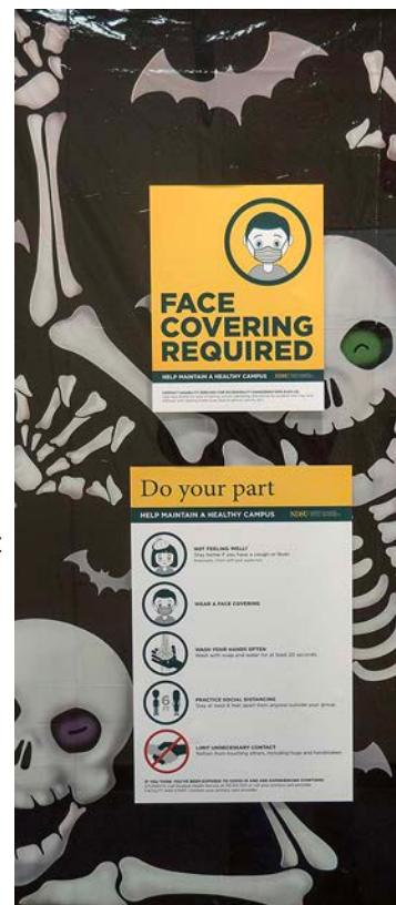
Halloween decoration 2020.