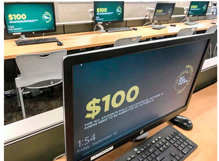
Students were strongly encouraged to vaccinate beginning fall 2021 after a Covid vaccine became available early that year.