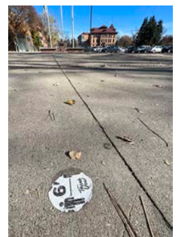
Worn social distancing sticker, November 2022.