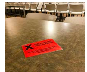
Table sign, food court, May 2020.