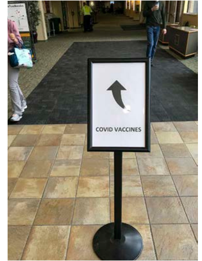
Free Covid vaccinations at Memorial Union, May 2021.