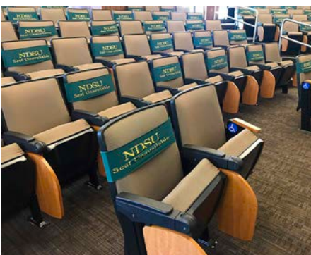
Minimum social distancing requirements enforced, Minard Hall, September 2020.