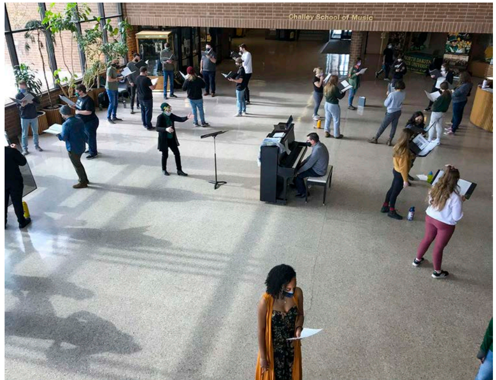
NDSU choir practice, Reineke Fine Arts Center, February 2021.