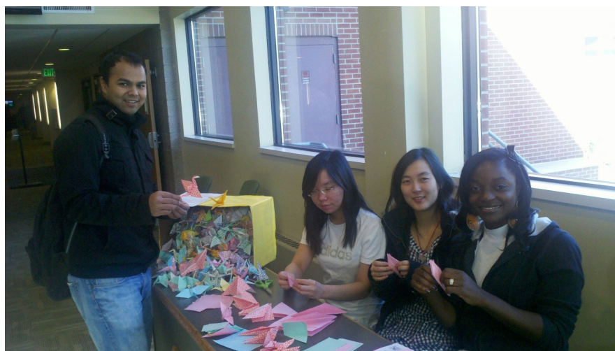
NDSU students folding cranes for Japan

Contact Information: Regina.Ranney@ndsu.edu