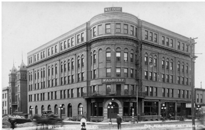
The Waldorf Hotel greeted visitors arriving via the Northern Pacific at the nearby depot.