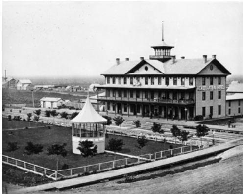
Headquarters Hotel and Northern Pacific Depot (1879) at the northwest corner of Broadway and Front Street (present-day Main).