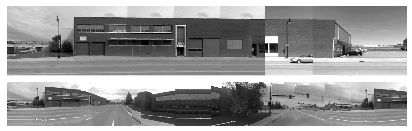
Figure 2. Main Avenue, Fargo, North Dakota, in Google Street View.