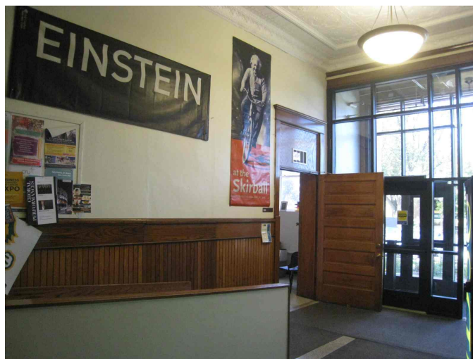
The north entrance of South Engineering with two Einstein banners that were donated by Angie Dickinson, an American actress and native of North Dakota.

The Department of Physics wishes to thank all donors who have contributed to our scholarship programs. You are making a significant difference in the lives of our students.