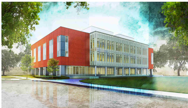
Rendering of the new STEM building (Image courtesy of Zerr Berg Architects/BWBR)

NDSU faculty teaching Science, Technology, Engineering and Mathematics (STEM) courses are eagerly awaiting the completion of the new STEM building. The building is opening its doors to students and instructors in January 2016. The building features “state-of the art” classroom spaces, which will support student-centered active-learning instruction.