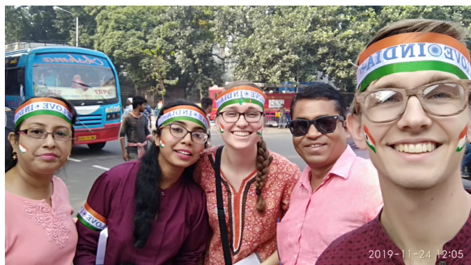
Reed with friends just before a cricket match between the Indian national team and the Bangladesh national team

My time in the research lab was spent making hybrid silicon nanocrystal-layered perovskite thin film LED devices. Such devices would utilize the advantages of the excellent inter-plane conductivity of layered perovskites and the exceptional photoluminescence properties of silicon nanocrystals if proper loading could be achieved. However, after four months of research in the lab, the COVID-19 pandemic started and I was forced to return to the USA five months early.