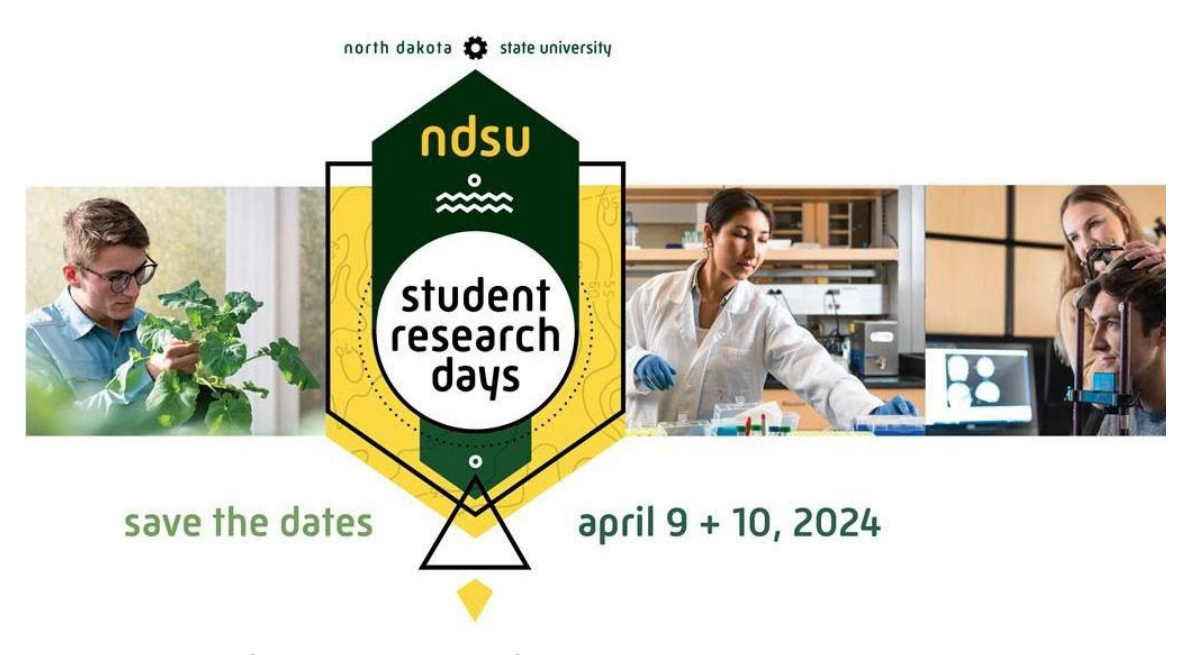
Call for Evaluators for Student Research Days

This program is supported by an Institutional Development Award (IDeA) from the National Institute of General Medical Sciences of the National Institutes of Health under grant number P20GM103442.