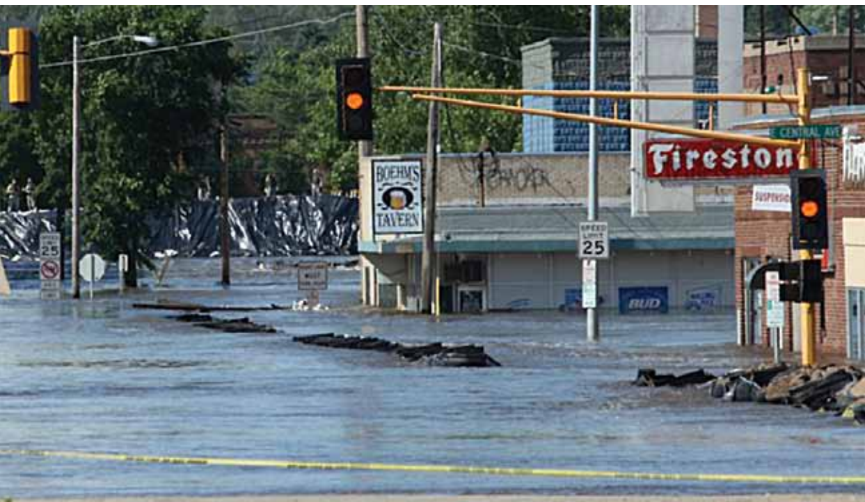
Website users submitted photographs like this one to keep the public informed of the changing flood conditions throughout the Minot, N.D., area.

According to Wolf-Hall, several toxigenic fungi in the genera Aspergillus and Penicillium are known to contaminate agricultural crops and produce ochratoxin A (OTA), a possible human carcinogen. It has been associated with nephropathic diseases in animals and humans. Because of diverse growth characteristics, the fungi and OTA have been found in a variety of agricultural commodities worldwide, including cereal grains, nuts, dried fruits,