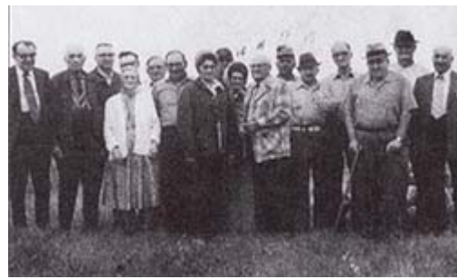
Ground Breaking Ceremony, June 15th, 1973 (Exhibit #9)