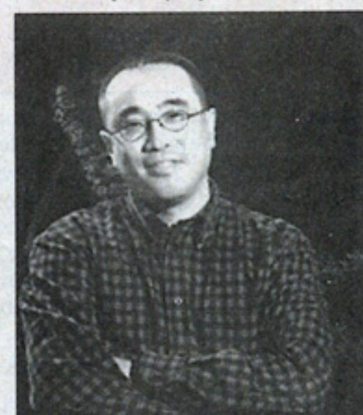
Playwright Zhao Daming