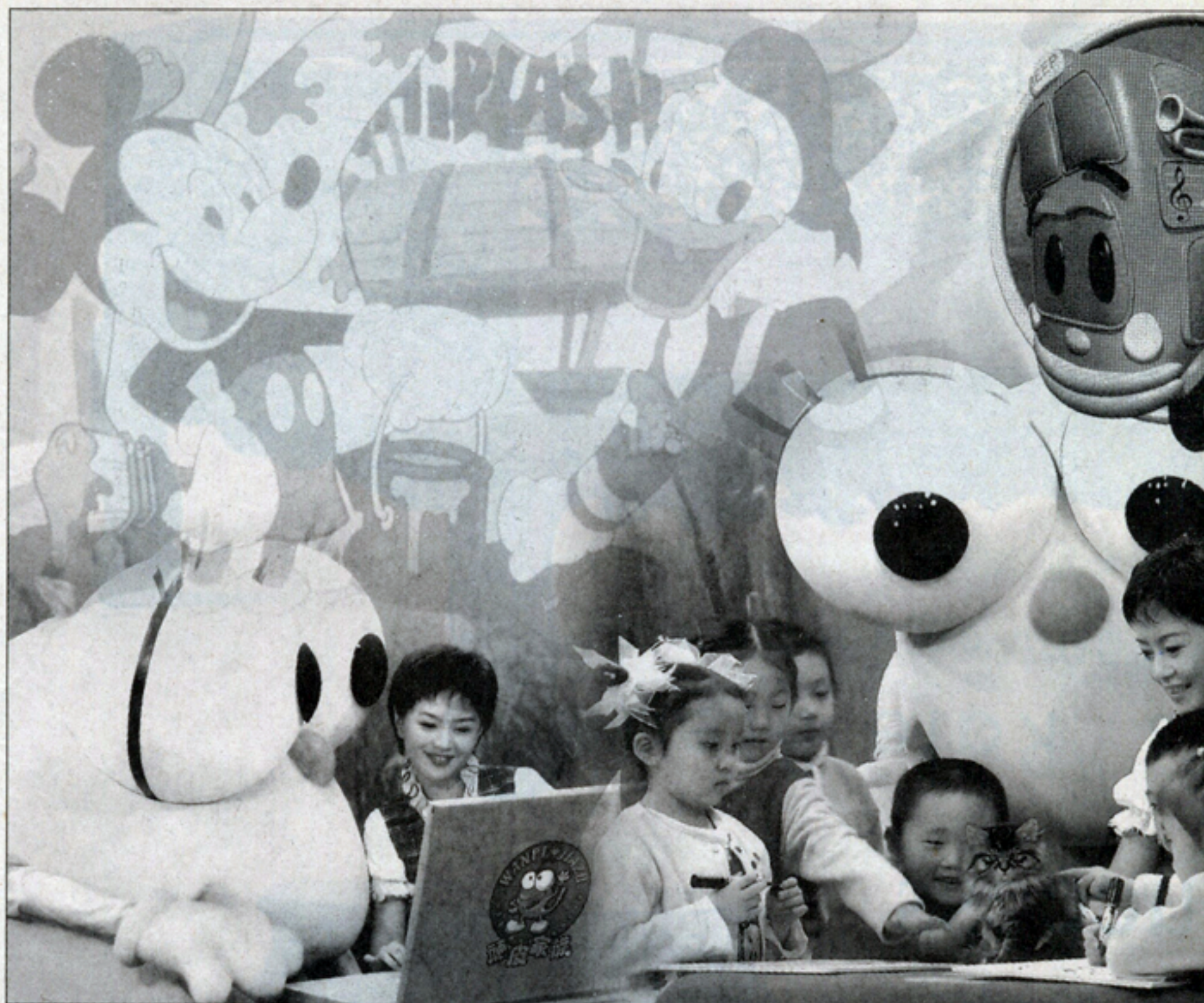
"Dafengche" encourages children to give their ideas and to be creative.