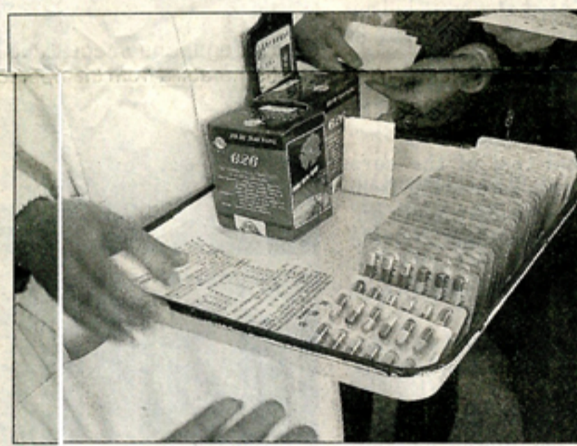
Ministry of Public Security statistics show that, of the 01,000 drug addicts registered in 2001, 85.1 per cent were between the ages of 15 and 35.

"Social acceptance is vital to keep former addicts away from drugs or else they will be pushed back to the abyss," he said.