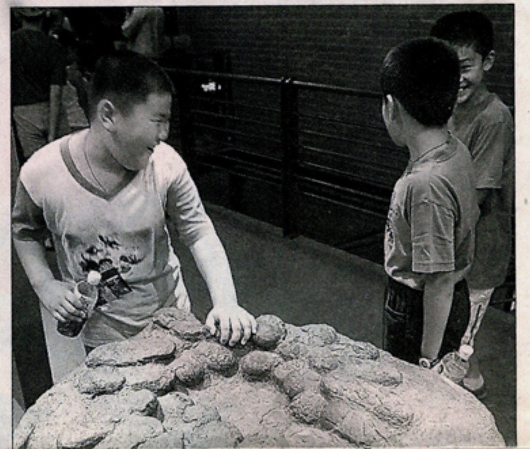
Knowing by touching: A boy touches the fossil of dinosaur eggs.

There is also the unique feathered dinosaur fossil that belongs to the 130-million-year-