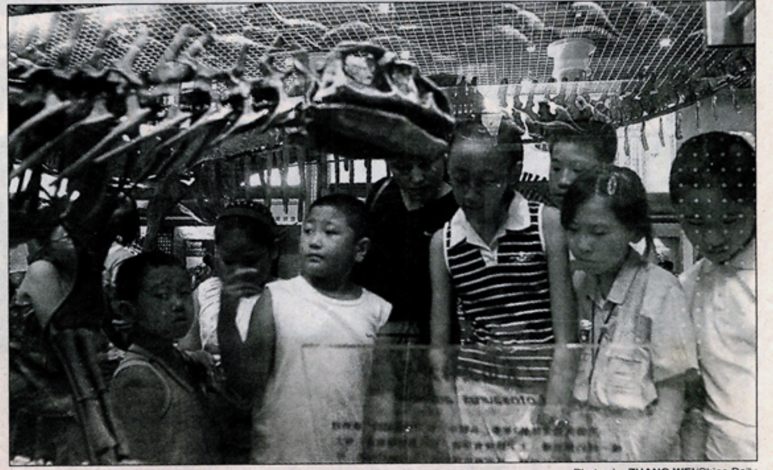
Curiosity: Children carefully read an introduction to the dinosaur skeleton.

"The museum should be a place that offers people happiness at the same time it deserves more