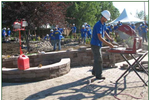
Volunteers working on the water feature, walk-ways and retaining walls in the back yard.

It was a special opportunity to be a part of and we are extremely proud of our students for their good work and dedication they showed in all weather conditions.