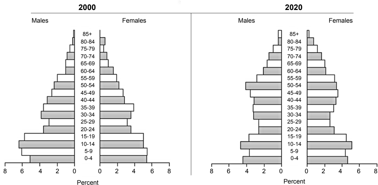
Table 2. Population Projections by Age and Gender, 2005, 2010, 2015, and 2020: Sioux County