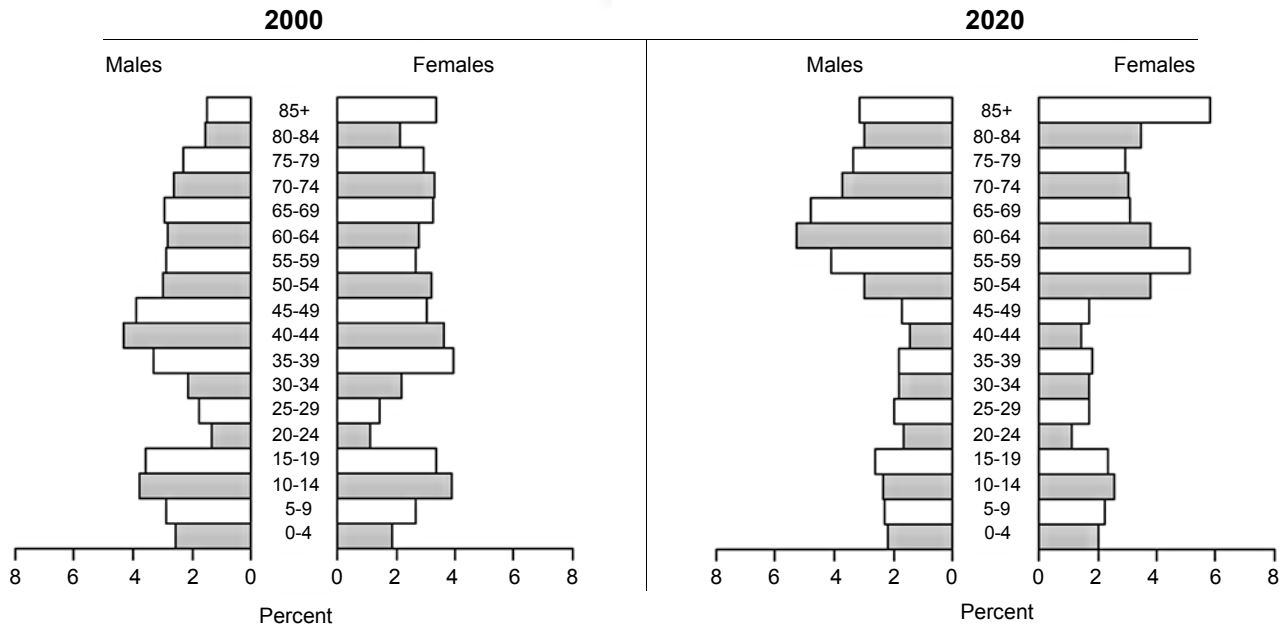
Table 2. Population Projections by Age and Gender, 2005, 2010, 2015, and 2020: Wells County