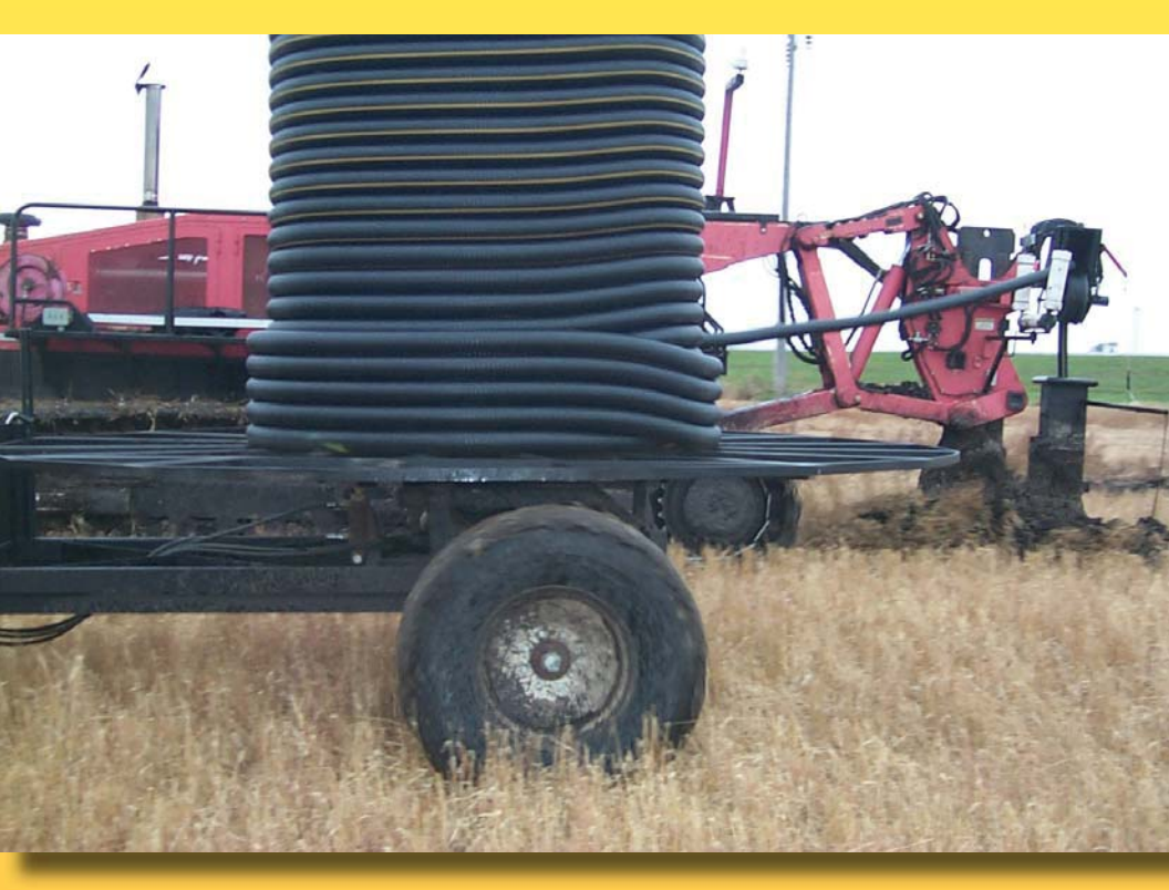
Figure 3. Installation of tile drainage in progress in Ramsey County along state Highway 17 near Edmore, N.D.