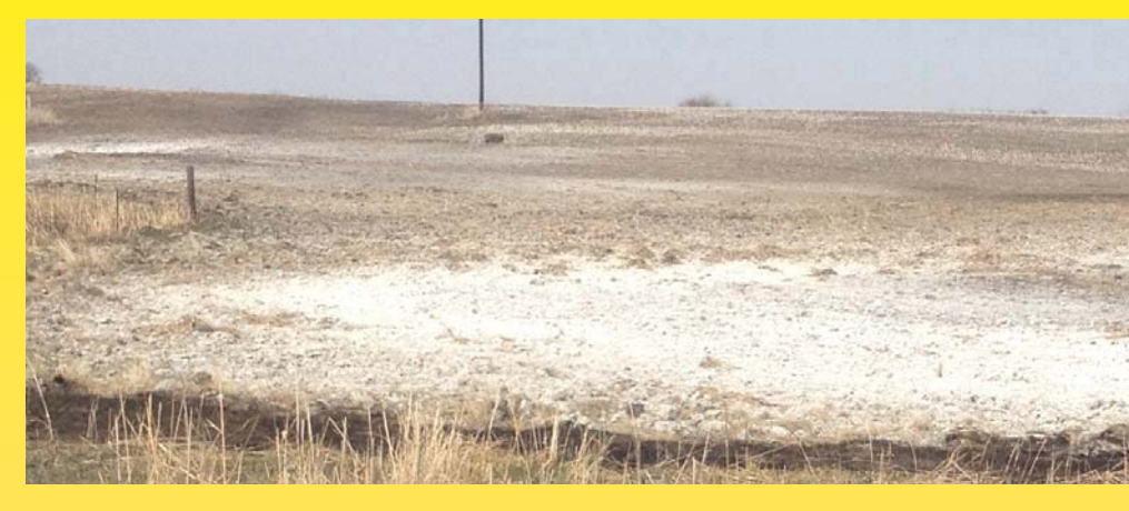
Figure 1. A typical saline spot on state Highway 17 near Edmore, N.D.

Saline soils have high enough levels of soluble salts in the soil water to negatively affect plant growth and crop yields, and even cause plant death under severe conditions (Figure 1).