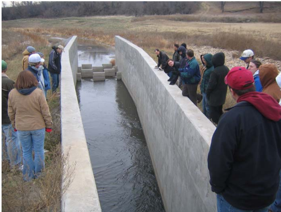
Pipe outlet structure of Maple River dam under low flow conditions. Some of the WRRRI Fellows along with hydrology course students from NDSU are taking a tour.

The Cass County Joint Water Resource District sponsored a Maple River Dam dedication and ribbon cutting ceremony on July 17 at the dam site, located in southeast North Dakota, approximately eight miles northeast of Enderlin. Governor John Hoeven, members of the North Dakota State Water Commission, and several other dignitaries were present for the dedication. Maple River Dam is a 70-foot high earthen embankment, capable of temporarily retaining up to 60,000 acre-feet of floodwater. The dry dam is designed to provide flood protection along the Maple, Sheyenne, and Red Rivers."