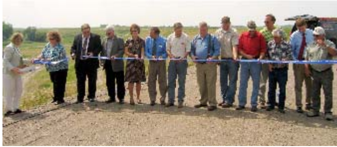
Maple River Dam Ribbon Cutting Ceremony

The Cass County Joint Water Resource District sponsored a Maple River Dam dedication and ribbon cutting ceremony on July 17 at the dam site, located in southeast North Dakota, approximately eight miles northeast of Enderlin. Governor John Hoeven, members of the North Dakota State Water Commission, and several other dignitaries were present for the dedication. Maple River Dam is a 70-foot high earthen embankment, capable of temporarily retaining up to 60,000 acre-feet of floodwater. The dry dam is designed to provide flood protection along the Maple, Sheyenne, and Red Rivers."