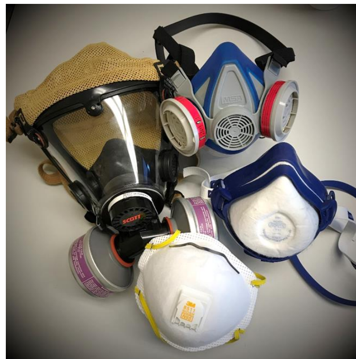
Non-powered APR with Particulate Filtering Elements: clockwise from bottom: N95 FFR; full facepiece APR with dual replaceable P100 filters; half facepiece APR with dual replaceable P100 filters; half facepiece APR with replaceable N95 filter

Helpful Web Resources – https://npsec.us/respirators