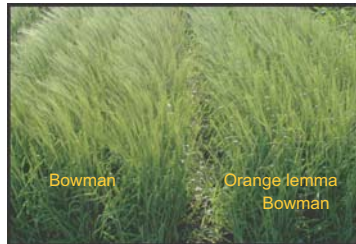
Fig. 1. Isolines of Bowman 2-rowed barley.