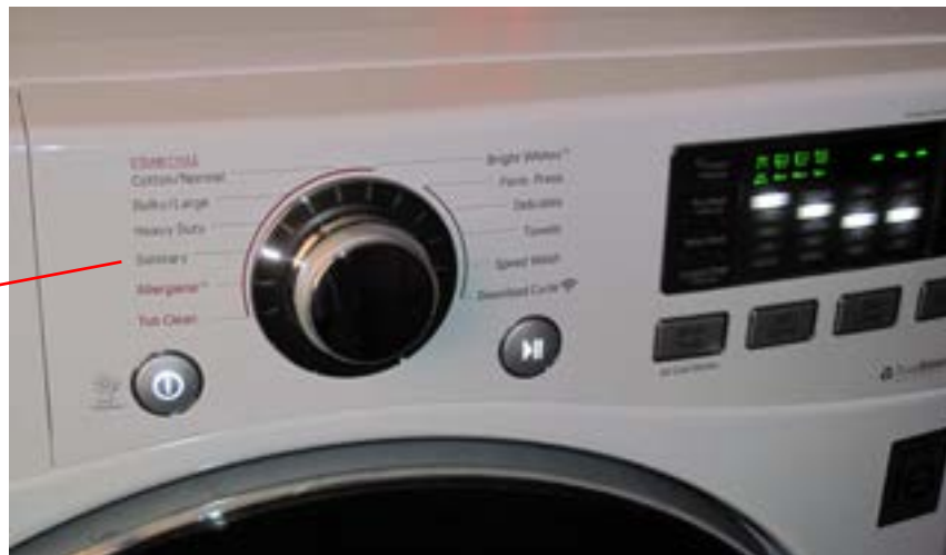
Figure 8. Digital control set to “Sanitary.”