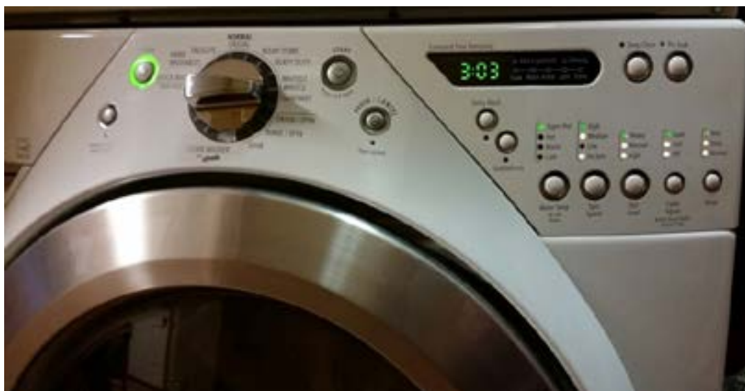
Figure 7. Front-load washing machine with digital controls.

A heating element in the machine takes water from the domestic hot water line and heats it to temperatures of 150 to 160 F. The feature is especially useful for cleaning heavily soiled diapers or reducing allergens in bedding. ( Figure 8, Page 6 ) This option likely would improve the removal of pesticides from garments, but it has not been evaluated.