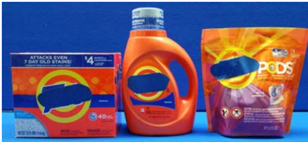
Figure 6. Dry detergent, liquid detergent and detergent-containing pods.