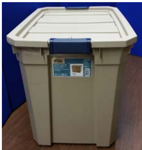
Figure 2. Plastic storage bin with sealable lid available at most home improvement stores.