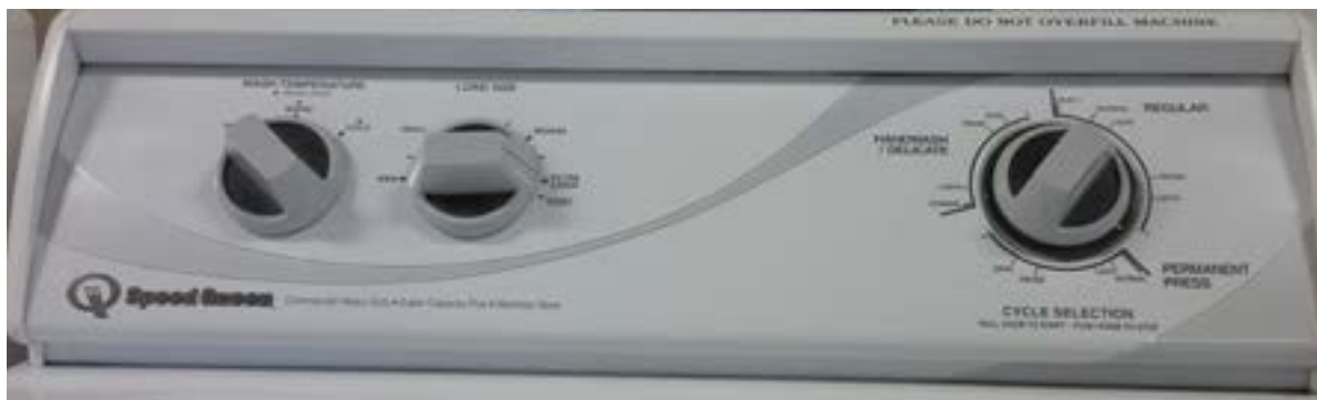
Figure 9. Basic/mechanical control panel.

Most of the recommendations listed in this publication have not been tested with some of the new “breathable” or synthetic fabrics. Likewise, many of the water/chemical-repellent finishes developed during the last two decades have not been evaluated. In these situations, users should check with the manufacturer of these products for cleaning recommendations.