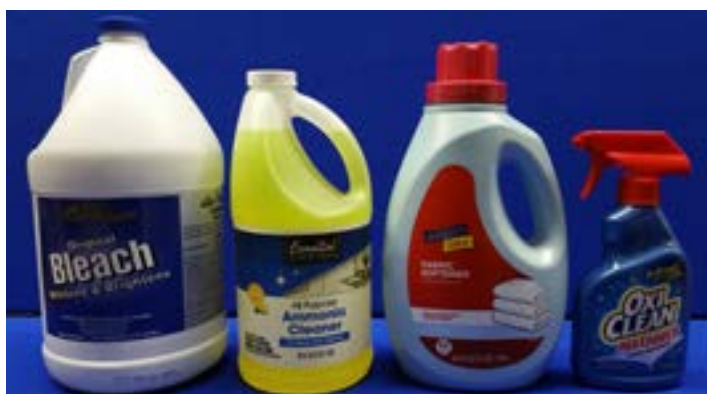
Figure 5. Bleach, ammonia, fabric softener and stain treatment products do not improve wash efficiency.