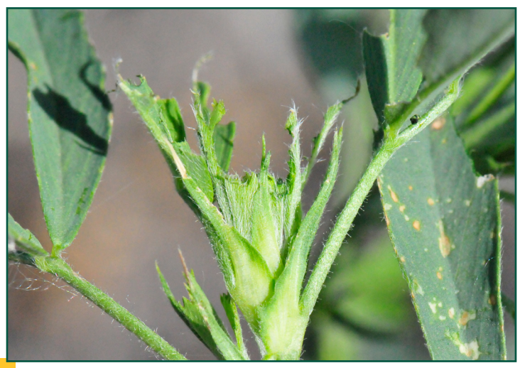
Figure 10. Damaged growing point of alfalfa from blister beetle feeding

Adults range from ½ to 1 inch long and have a characteristic narrow, elongate, soft body with a 'neck' formed by the tapering of the pronotum between the head and abdomen (Figure 7). The flexible wing covers are rounded over the abdomen and the color varies from black to gray to brown. Some species have a metallic sheen like the large purplish-green color of the Nuttall's blister beetle.