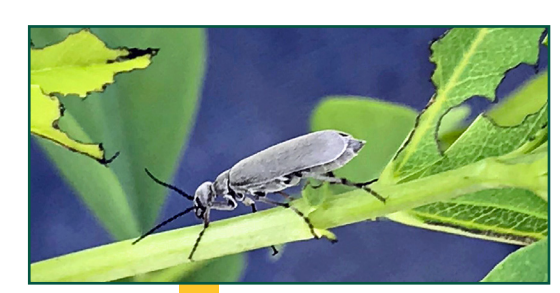
Figure 2. Ash-gray blister beetle feeding on Baptisia (flower) causing defoliation