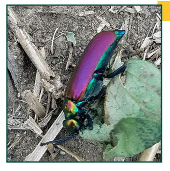
Figure 6. Nuttall's blister beetle (Brandon Aldinger)