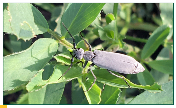
Figure 7. Ash-gray blister beetle on alfalfa, note neck-like area between head and prothorax (Marisol Berti, NDSU)