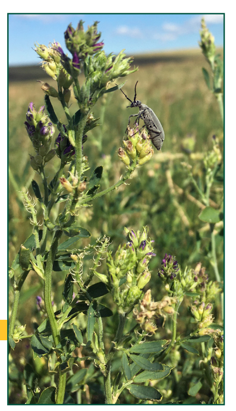
Figure 9. Ash-gray blister beetle feeding on leaves, stems and flowers of alfalfa