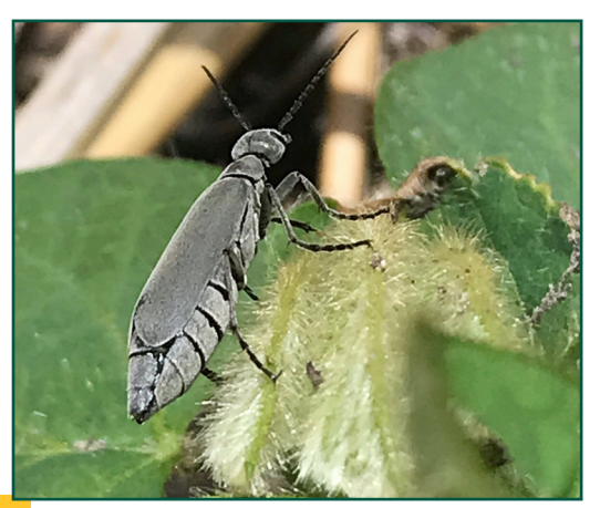
Figure 12. Ash-gray blister beetles on soybean