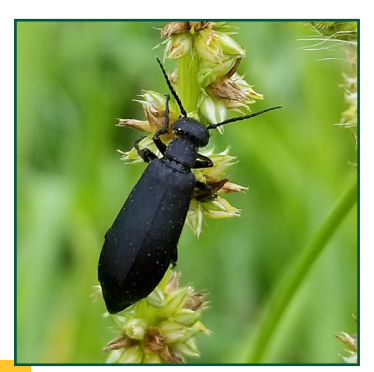
Figure 4. Black blister beetle feeding on weed seeds