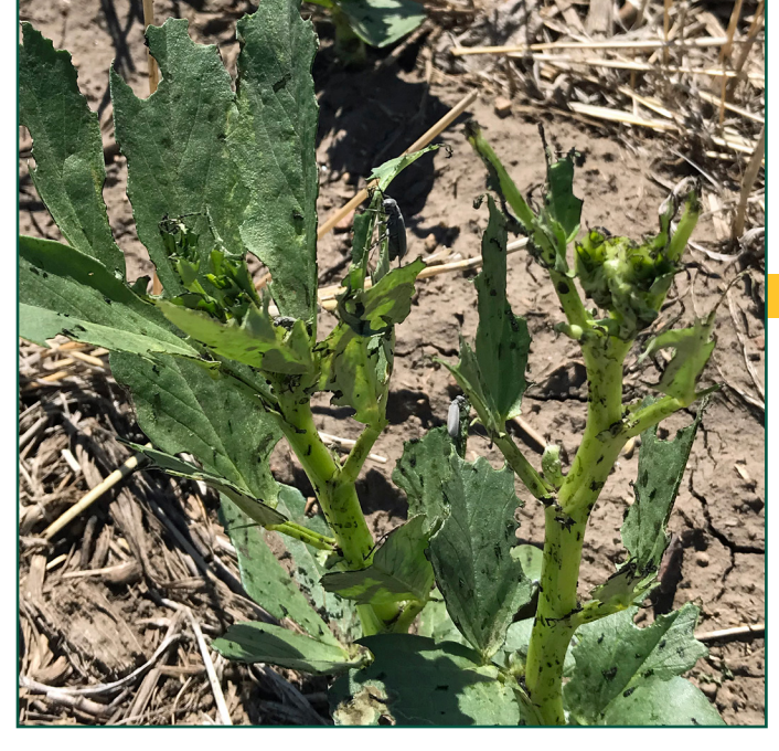
Figure 11. Ash-gray blister beetles on faba beans causing severe defoliation

Alfalfa is a preferred host of blister beetles. Several management options are available, which can reduce the number of blister beetles found in forage crops, but none will eliminate the problem. There is no treatment threshold for blister beetles in alfalfa hay.