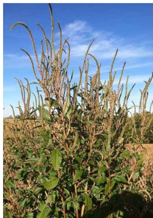
Palmer amaranth is a type of pigweed that grows 5-7 feet tall, and can cause devastation to some row crops, especially soybeans and corn.

“As a gardener, I love the colors and the flowers we have in these habitat plots, so I’m drawn to them for the beauty they offer,”