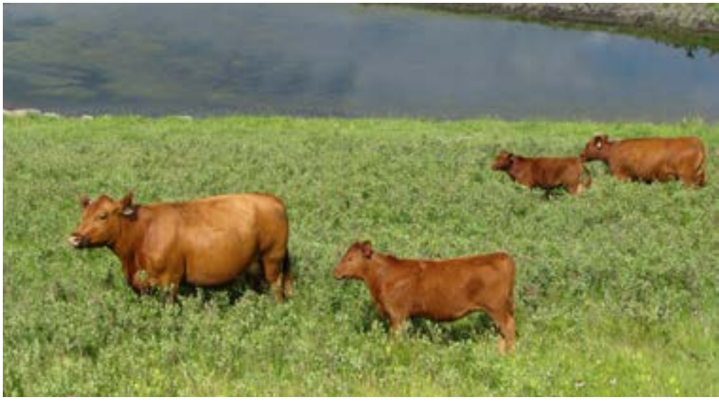
Water is an important nutrient for livestock. Water quality can affect livestock performance and health.

North Dakota State University Fargo, North Dakota