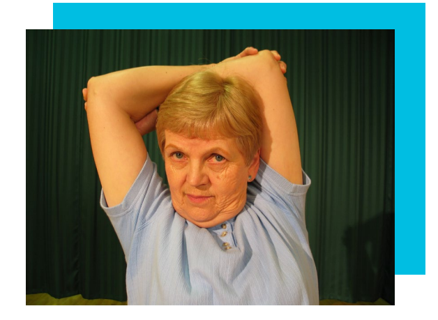
To stretch back of arm: Sit or stand straight. Grab one elbow with the opposite hand and gently pull your elbow behind your head. Hold for six seconds, then relax. Repeat twice.