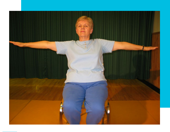
To stretch trunk: With arms out to the side, level with shoulders, shift shoulders sideways to right. Hold. Stretch to left. Hold. Don't bounce!

To stretch lower back and hamstrings: Sit straight in chair. With knees together, bend forward and stretch toward the floor (or toes). Hold. Return to original position. Avoid this and other bending-over exercises if they make you dizzy.