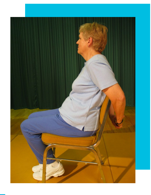
To stretch shoulders: Sitting straight, wrap arms around chair back. Pull backward away from chair back. Relax and repeat.