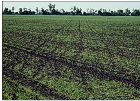
Figure 1. Spring wheat seedling damage from a fall anhydrous ammonia application in high-carbonate soils.

Urea or liquid sources of nitrogen may be applied preplant and incorporated into the soil prior to seeding. Manure rates should be modest because predicting the actual nitrogen availability from the manure is difficult.