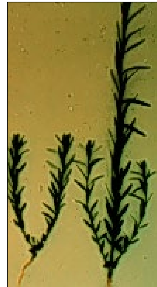
Figure 3. Zinc deficiency in flax - "chlorotic dieback." Death of terminal bud stimulates growth of stems from axillary buds, resulting in a candelabra effect.

Fine granular Zn-sulfate is available, and 3 to 5 lb/acre Zn could be applied through granular herbicide applicators prior to seeding with more immediate results. Side-banded treatments of 1 quart/acre Zn-chelate or an ammoniated Zn liquid fertilizer also may be effective.