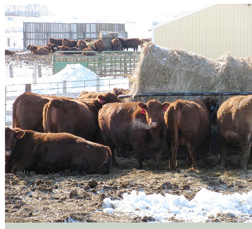
Removing snow and ice buildup provides better footing for the cattle and easier access to feed in the bunk.

Frozen manure lumps in high-traffic areas can increase stress on feet and legs. Scrape and pile frozen manure and snow in areas where runoff is contained. Scraping allows easier movement for cattle, machinery and people checking on cows. If snow removal from the pens is necessary, dump the snow in a site that drains into a containment structure. Runoff from clean snow should be directed away from containments.