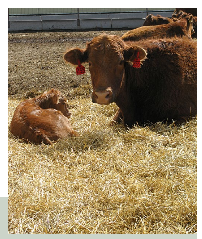
Bedding is important for beef cows and newborn calves. (Carrington Research Extension Center)

Portable calf shelters should be utilized where cows and new calves do not have access to creep areas inside sheds or protected lots. Shelters should be moved periodically, and bedded and checked often.