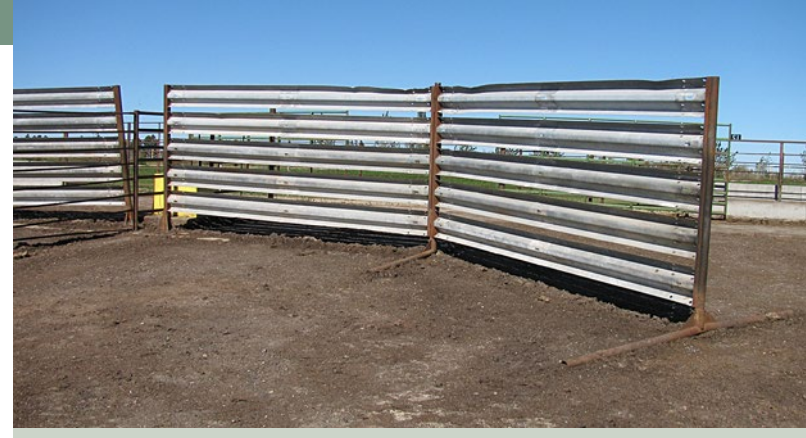
Permanent or portable constructed wind fences protect beef cows. (Carrington Research Extension Center)

Beef cows need protection from the wind, especially during periods of bitterly cold temperatures and severe wind chill (Figure 2, Wind chill chart). Protection can be provided by constructing wind fences or planting shelterbelts. The combination of constructed wind fences and mature trees provides excellent protection (Anderson and Byrd, 2004). Multiple tree rows of varying height and maturity planted 50 to 100 feet upwind from the wintering pens will slow the wind and allow drifting snow to drop among the trees, thereby reducing the amount of snow deposited in the pens. Shelterbelts should not be grazed because the damage from grazing will shorten the life or possibly even kill the trees and significantly reduce the wind and snow protection afforded by the trees, and the underbrush and grasses between the tree rows. Tree species selection and planting information is available from local Extension or Natural Resource Conservation Service offices, which have programs to assist cattlemen in shelterbelt development.