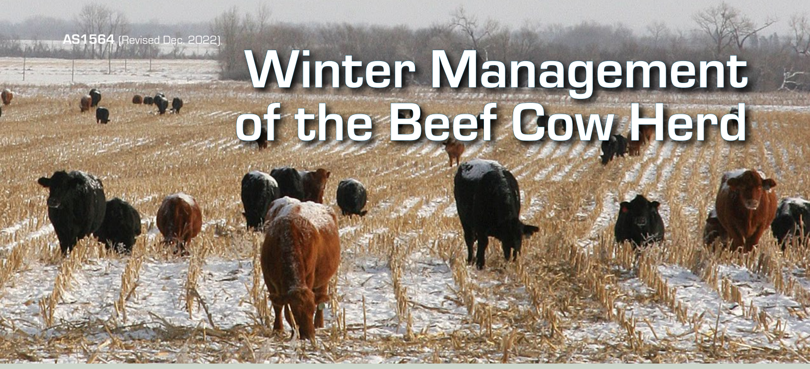
Good winter management practices help cattle tolerate the wind and cold temperatures.