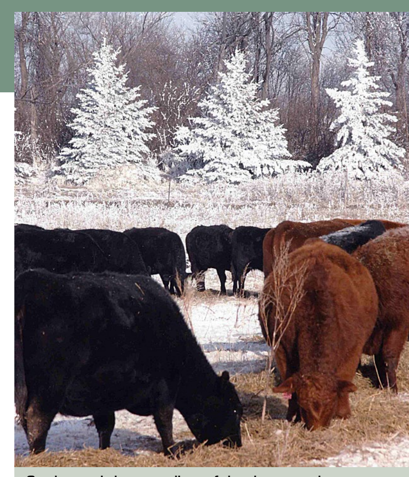
Cattle can thrive regardless of the elements when producers use good husbandry practices.

Schroeder, J.W. 1994. Interpreting Forage Analysis. NDSU Extension publication AS-1080.