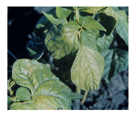
Figure 2. Zinc deficiency in pinto bean.

Iron fertilizer sprays are available but have not alleviated the problem consistently. The severity usually is caused by wet soil conditions that increase soil bicarbonate levels. As soil dries, bicarbonate levels drop and affected plants usually green up. If a field has a known susceptibility to iron deficiency chlorosis, selecting varieties that have shown more tolerance to the conditions is recommended.