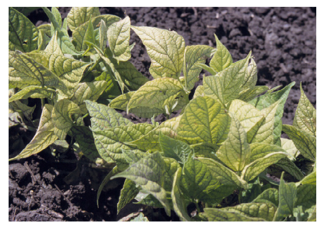
Figure 3. Iron deficiency chlorosis on a saline, calcareous soil near Arthur, N.D.