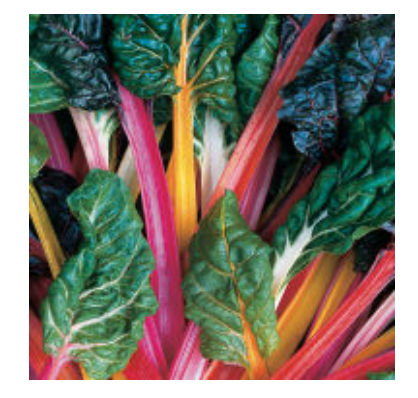
'Bright Lights' Swiss Chard