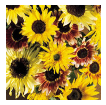
'Monet's Palette' Sunflower

#36. Sunflower, Soft Shades. 11 sites. 'Peach Passion' (rating: 3.33; recommended: 14%; preferred: 0%) and 'Starburst Lemon Aura' (rating: 8.00; recommended: 86%; preferred: 100%). 'Starburst Lemon Aura' clearly outperformed 'Peach Passion'. It was much more vigorous and its blooms were more abundant. All gardeners liked its starlike, light yellow blooms, both in the garden and as a cut flower. The performance of 'Peach Passion' was greatly disappointing. Several gardeners noted poor germination and weak growth. Its blooms have a distinctive color, but were few in number and lacked vibrancy.