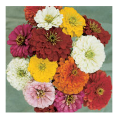
'State Fair Mix' Zinnia