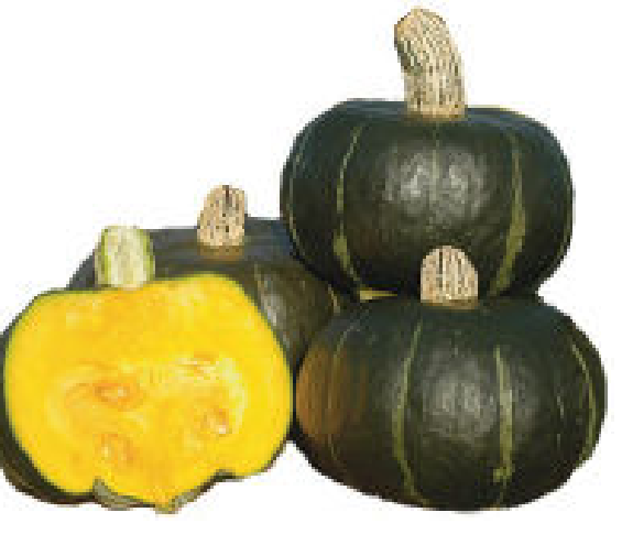
'Bonbon' Winter Squash