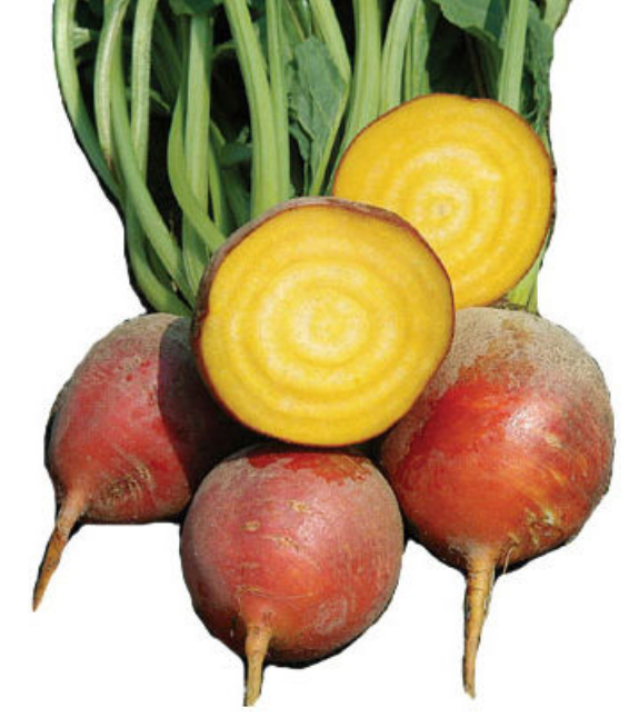
'Touchstone Gold' Beet

problems and poor root development for this variety. Its roots were hard and bitter. 'Atomic Red' was the better performer in this trial. It produced much higher yields and its roots were less bitter. Lycopene is better absorbed by the body when cooked and this is the only way that these red carrot varieties should be consumed. They are not as sweet nor as tender as traditional orange carrots.