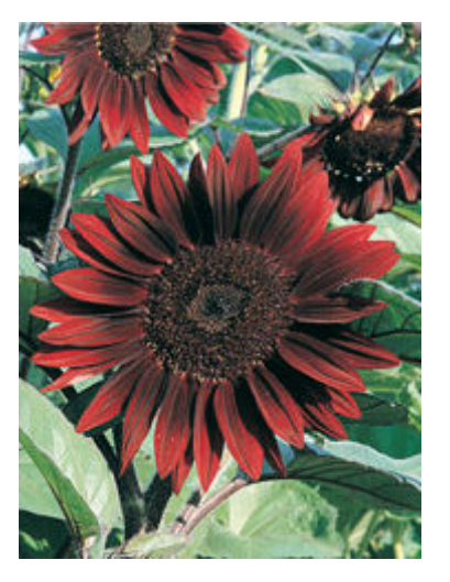
'Moulin Rouge' Sunflower