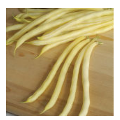
'Rocdor' Wax Bean