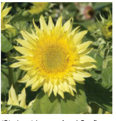
'Starburst Lemon Aura' Sunflower