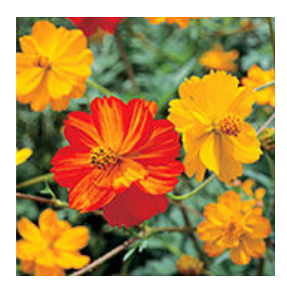
'Bright Lights' Cosmos