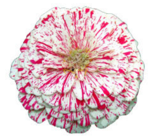
'Peppermint Stick Mix' Zinnia