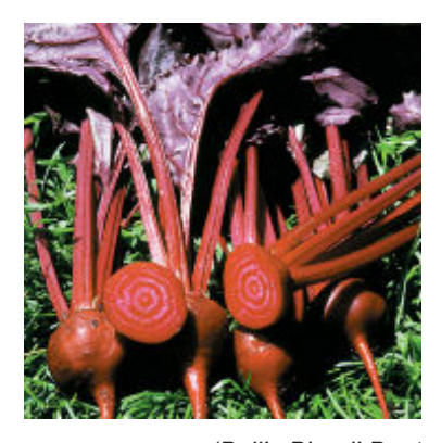
'Bull's Blood' Beet