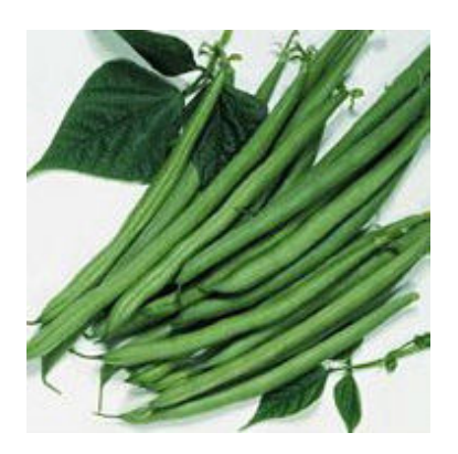
'Espada' Green Bean

In each of the trials, gardeners were asked to rate the performance of each variety using a scale of 1 to 10, with 1 = poor and 10 = excellent. They were asked which of the varieties they would recommend to other gardeners, and which of the two varieties they preferred. The following is a summary of results, including conclusions for each trial.