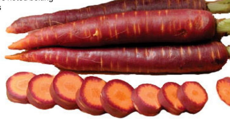
'Purple Haze' Carrot