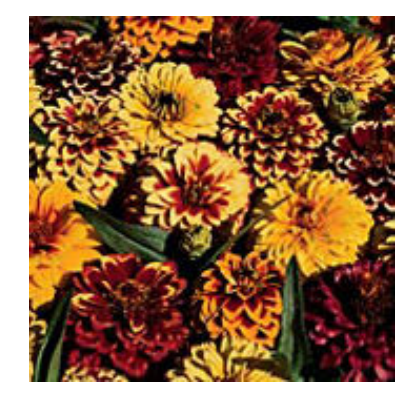
'Persian Carpet' Zinnia