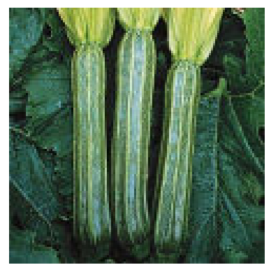
'Portofino' Summer Squash