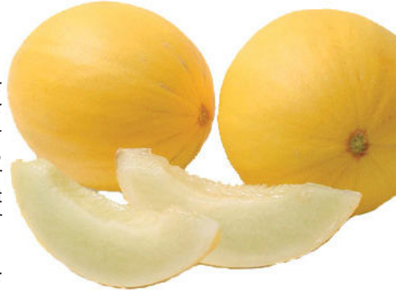
'Sugar Nut' Melon