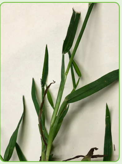
Figure 3b. Smooth crabgrass leaf sheath and blade – no hairs.