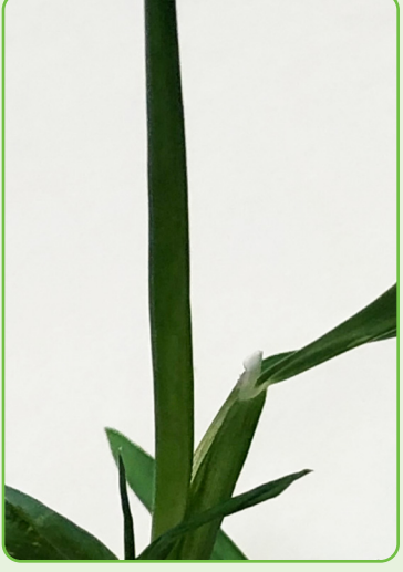
Figure 3a. Smooth crabgrass leaf sheath and blade showing membranous ligule.