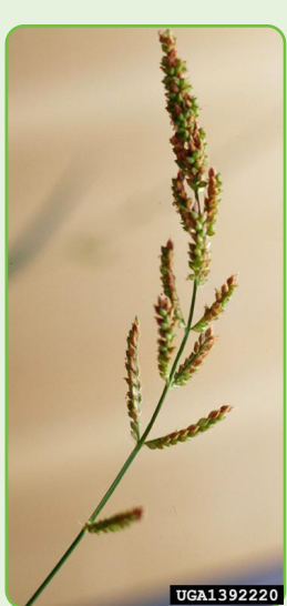
Figure 5a. The crabgrass

Figure 5c. The barnyardgrass seedhead has side branches.