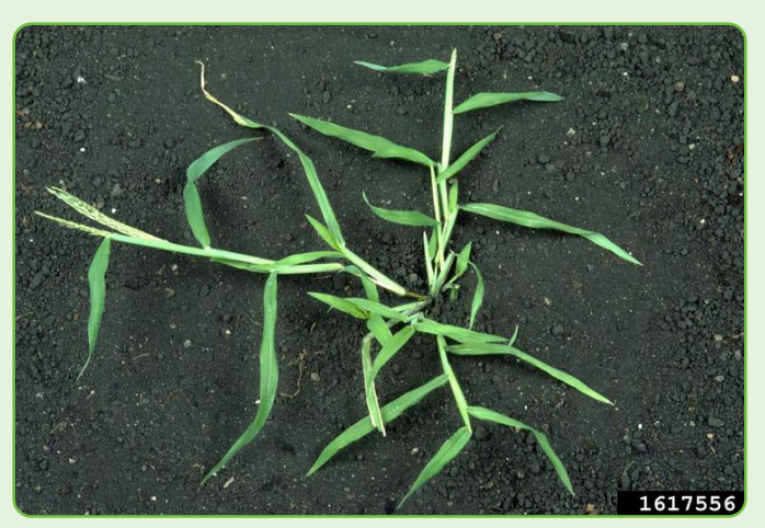
Figure 8. Crabgrass with seven tillers.

When cultural and preemergence control measures fail, postemergence herbicides can be used. Several herbicides are available for application on young crabgrass plants. Postemergence control is most effective when the crabgrass plant is in the seedling stage and before it has produced numerous tillers. Tillering is the production of new shoots on the side stems in grass plants (Figure 8).