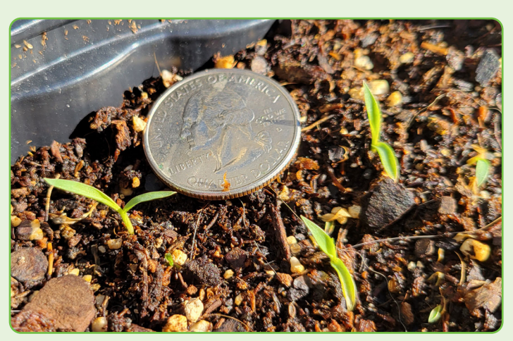
Figure 2. Crabgrass seedlings.