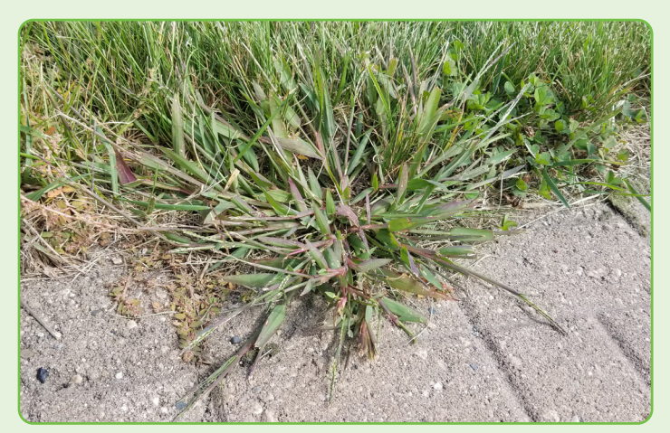
Figure 1. Crabgrass has a low growing, prostrate growth habit.

Quackgrass ( Elymus repens ) and barnyardgrass ( Echinochloa crus-galli ) can both be mistaken for crabgrass by homeowners because of their wide leaf blades. Quackgrass is a perennial grass, identifiable by its clasping auricles and pearly white underground rhizomes, which are both lacking in crabgrass. Herbicides commonly used for crabgrass are not effective in controlling quackgrass, which spreads in lawns primarily by its underground rhizomes.