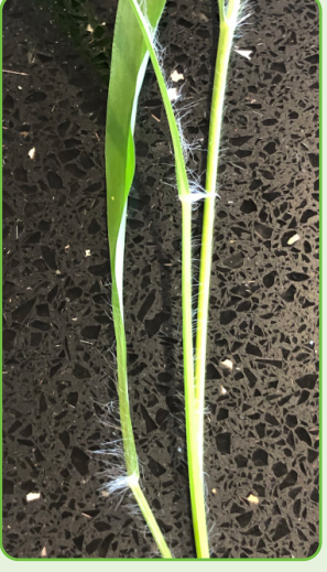
Figure 4a. Large crabgrass leaf sheath and blade showing fine hairs.