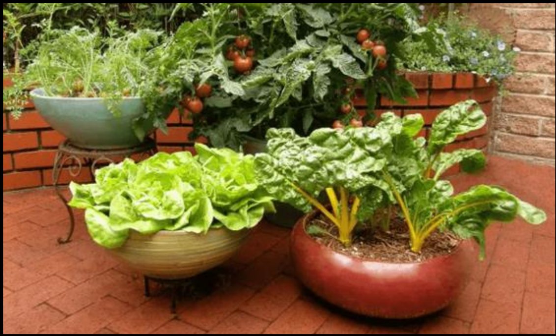
Pots and planters