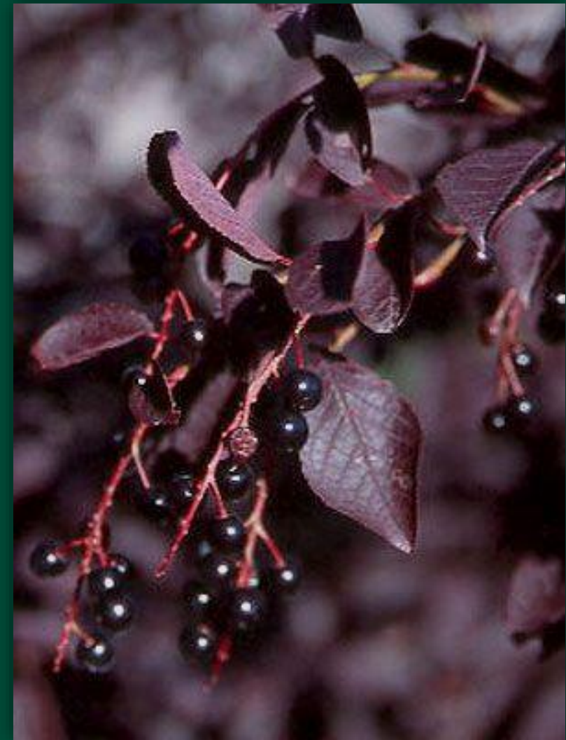
Canada Red Cherry, AKA Schubert Chokecherry