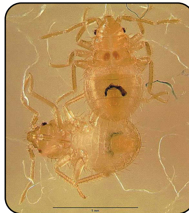
Figure 10. First instar bed bugs caught on a sticky trap