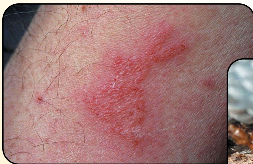
Figure 6. Bed bug bites on human arm causing inflammation

Several types of bed bug traps are available. Sticky traps or glue boards have not been very successful in monitoring for bed bugs (Fig. 10). Because bed bugs are attracted to carbon dioxide and chemical cues such