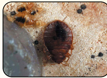
Figure 8. Adult, nymphs and blood spots on the underside of a recliner