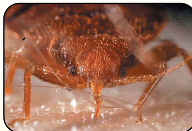
Figure 4. Close-up of bed bug feeding on human