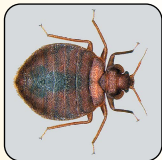
Figure 1. Adult bed bug (P. Beauzay, Dept. of Entomology, NDSU)

Bed bugs belong to the family Cimicidae, which includes many similar species. In our area, bat bugs ( Cimex adjunctus ) and swallow bugs ( Oeciacus vicarius ) are occasionally found in homes. As their names imply, bat bugs attack bats and swallow bugs attack swallows. These species are very similar in appearance to the common bed bug. Therefore, all bed bug identifications should be confirmed by an entomologist. All are blood feeders. The presence of bat bugs indicates the presence of bats roosting in the home, probably in the attic. Swallow bugs can move into the home after the birds have fledged and left their nests. Bat bugs and swallow bugs can and will feed on humans.