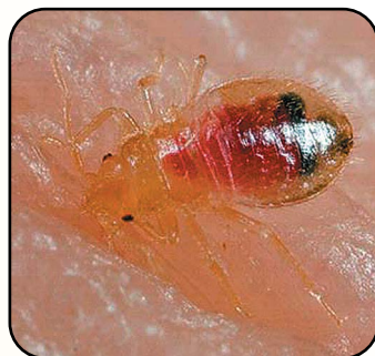
Figure 2. First instar nymph bed bug feeding on human