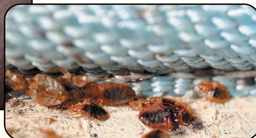
Figure 7. Adult, nymphs and blood spots on fabric of box spring