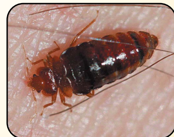
Figure 5. Engorged adult bed bug after feeding