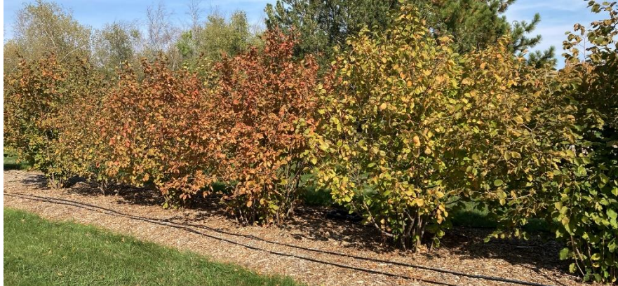
Poor hazelnut leaf color in 2021 from drought. Plants are numbered from R to L in this view

Hazelnuts: There was some winter injury to the Johnson hazelnuts this past year. Plant 1 should actually be removed since it does not harden off in time and always has winter injury. There was also injury to plants 2, 6 and the St. Lawrence Nursery Hazelbert shrub. Plants 3, 4 and 5 seemed fine. These three plants had nice crops, with the most on plant number 3 which has been fruiting the longest. Squirrels chewed right through my hot pepper spray efforts and the nuts were gone by August 7 th .