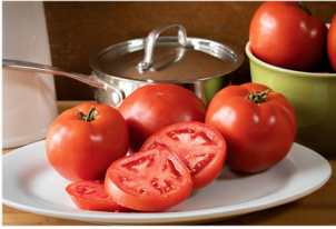
Big Beef Plus