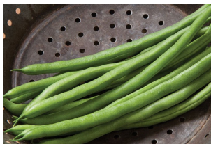
Jade, Homerun, Red Tail