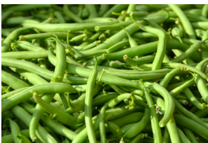
Bush Blue Lake 274