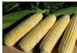
American Dream, Xtra Tender 274A, Troubadour