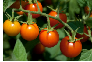
Sun Gold, SunSugar