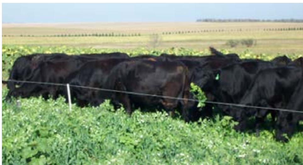
Cover crop grazing in dual-crop system

9 Based on four years' data on trials from the Central Grasslands Research Extension Center.