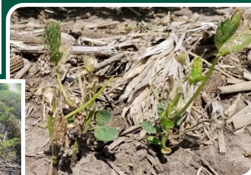
Figure 9. Dead soybeans from soybean gall midge infestation near field edges