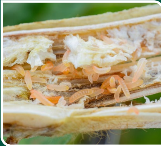
Figure 4. White-mold gall midge larvae feeding on white mold-infected stem