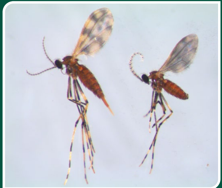
Figure 1. Adult female (left) and male (right) soybean gall midge

During 2019 soybean surveys, the white-mold gall midge was found in Minnesota and North Dakota; however, it is widespread in the northern region of the U.S. This tiny gall midge usually is associated with the fungus Sclerotinia spp., or white mold. The white-mold gall midge is not an insect pest of soybeans , and it primarily has been reported as a white mold fungus feeder.