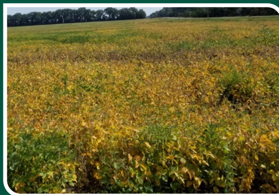
Figure 11. Soybean field with severe Sclerotinia white mold. Notice the dead plants in the middle of the field.