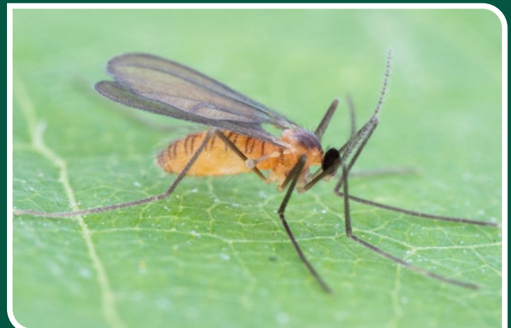
Figure 2. Adult white-mold gall midge (J. Moisan-De Serres, Laboratoire d'Expertise et de Diagnostic en Phytoprotection, Ministère de l'Agriculture Québec, Canada)