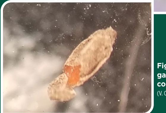
Figure 6. Soybean gall midge larval cocoon from soil