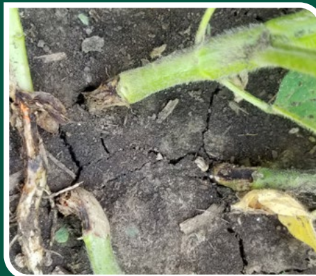
Figure 7. Dark discolorations from soybean gall midge feeding injury at the base of soybean stems

Because this insect does not feed directly on vegetative or reproductive tissues of soybeans, and predominantly feeds on the white mold, growers do not need to control the white-mold gall midge. However, growers should consider managing severe white mold infections in their fields.