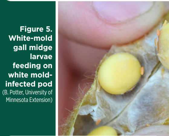
Figure 5. White-mold gall midge larvae feeding on white mold-infected pod