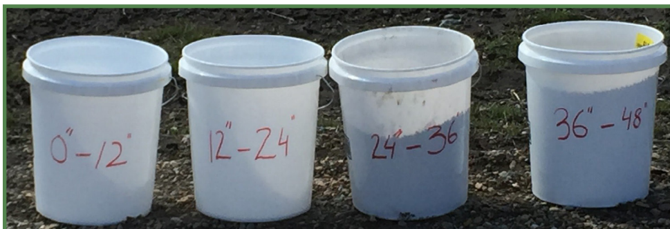
Figure 6. A 4-foot-deep sample is being separated in 12-inch increments.