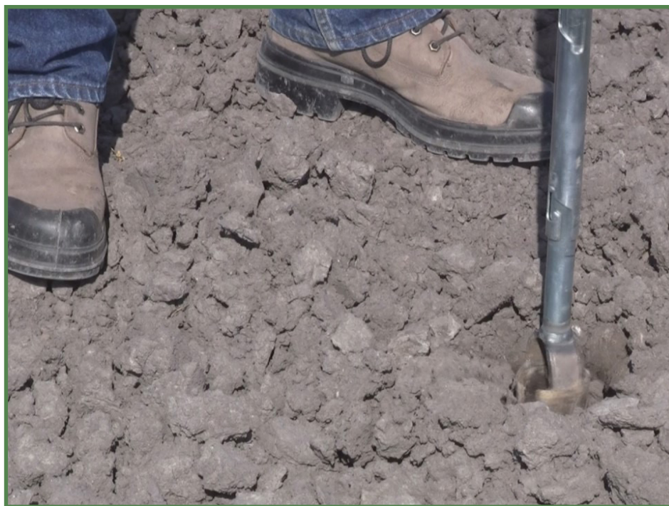
Figure 4. A soil core is being taken from a saline-sodic zone with a hand-held auger.