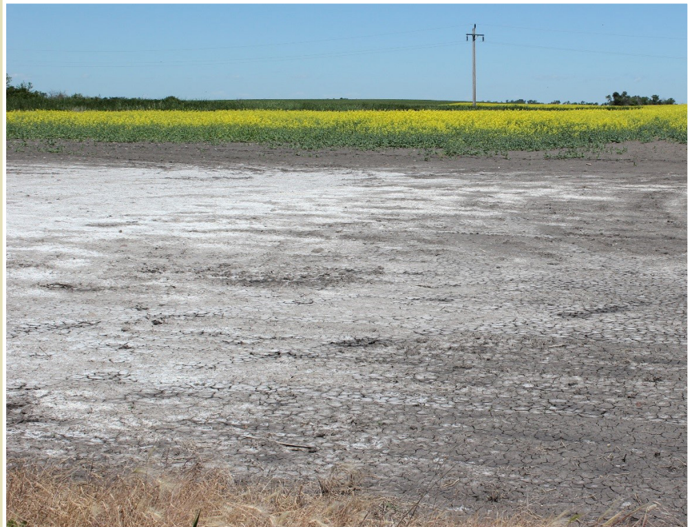
Figure 1. A salt-affected unproductive area sits next to productive land with canola in Walsh County, North Dakota.

A soil can be mapped as very fertile; however, it may not be productive due to high salinity and/or sodicity. Soils with high salinity and sodicity usually have adequate levels of essential plant nutrients because the nutrients are not being removed due to poor or no plant growth and low grain/fodder production, compared with more productive areas of the field.