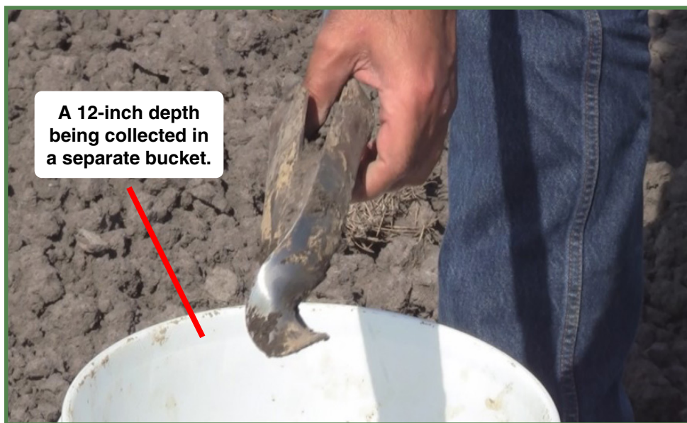
Figure 5. Soil depth is being separated in 12-inch increments. (Naeem Kalwar, NDSU)

Remediating soil sodicity will require application of amendments that add free calcium ( \text{Ca}^{2+} ) to the soils to raise \text{Ca}^{2+} levels versus \text{Na}^+ . For example, agricultural grade gypsum ( \text{CaSO}_4 \cdot 2\text{H}_2\text{O} ), calcium chloride salt ( \text{CaCl}_2 ) and lime ( \text{CaCO}_3 ) add \text{Ca}^{2+} directly to the soils, whereas elemental sulfur ( \text{S}^0 ) first gets oxidized to sulfate ( \text{SO}_4^{2-} ) and then converts into sulfuric acid ( \text{H}_2\text{SO}_4 )