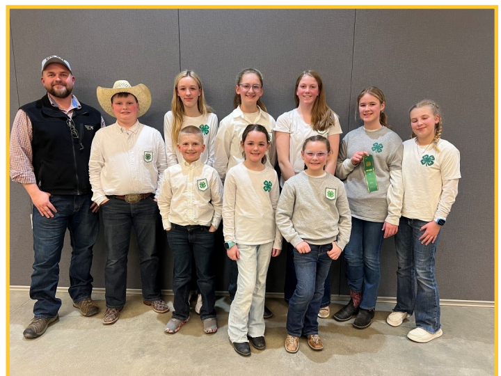
State 4-H Livestock Judging Contest: 7th Place Team