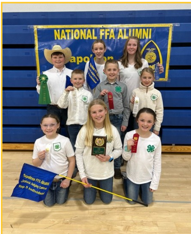
Napoleon FFA Alumni Contest: 1st Place Team

Logan County Extension/4-H partnered with Napoleon FFA Alumni to provide volunteers and judges for various contest events including: Livestock Judging, Ag Sales, Agronomy. Nearly 100 volunteers were needed for this year's event that supported nearly 400 FFA and 4-H youth participants in their chosen contests. We take great pride in our long standing and community beneficial partnership with such far reaching impactful events.