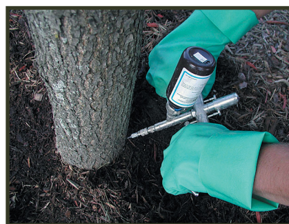
Figure 20. Trunk injection for control of emerald ash borer

Imidacloprid trunk injections resulted in less insect mortality and varying degrees of EAB control. Overall, trunk-injected emamectin benzoate provided the highest level of EAB control when compared with other insecticide products and application techniques.