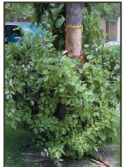
Figure 15. Epicormic branching from tree attacked by emerald ash borer