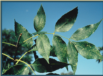
Figure 11. Green ash tree (N.D. Tree Handbook, NDSU)