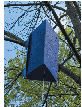
Figure 17. Purple prism trap used for surveying for emerald ash borer

Ash trees in the native range of EAB may be more resistant because their natural defenses have co-evolved throughout time. Researchers have observed that ash trees native to Asia have reduced larval tunneling and only stressed trees (for example, from drought) are colonized. Researchers also are studying Asian ash species as a possible source of resistance genes against EAB. Identification of resistant ash genotypes is important for reforestation and maintaining a market demand for ash in the nursery industry.