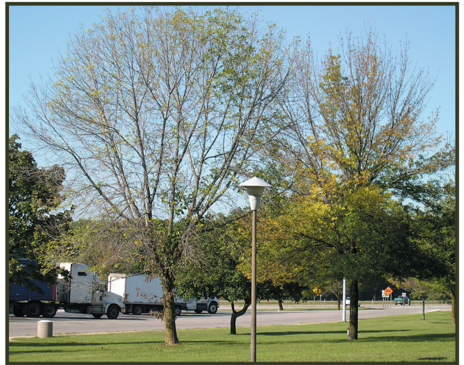
Figure 14. Dieback of tree crown