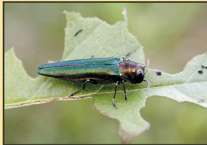
Figure 10. Emerald ash borer adult feeding on an ash leaf

Adults live for only three to six weeks and feed on foliage for one to two weeks prior to mating. Foliar feeding by EAB adults causes little damage to the ash tree (Figure 10). They mate and repeat the life cycle.