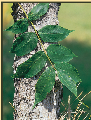
Figure 12. Black ash tree (N.D. Tree Handbook, NDSU)