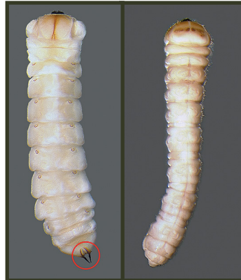
Figure 7. Comparison of prepupa of emerald ash borer (left) and red-headed ash borer (right). Circle shows two spines (urogomphi) on emerald ash borer larva