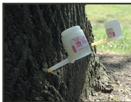
Figure 21. Mauget capsule injection for control of emerald ash borer (D. Cappaert, Bugwood.org)