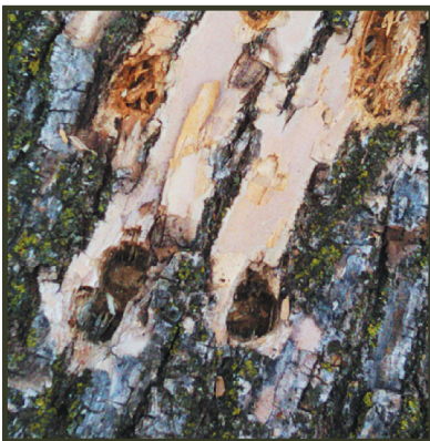
Figure 16. Woodpecker damage on emerald ash borer-infested tree

Beyond removal and replacement, the loss of benefits provided by ash trees will be enormous and expensive. Shelterbelts protect farmsteads, fields and livestock from harsh, drying winds in the summer and they capture snow in the winter, acting as living snow fences along highways and around many communities. In urban EAB-infested areas where ash trees have been destroyed, the loss of shade/protection from ash trees has resulted in increased costs associated with summer air conditioning and lawn watering, and home heating in the winter.