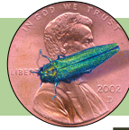
Figure 2. Size of emerald ash borer adult compared with a penny

Adults are recognized as metallic, wood-boring beetles (Family Buprestidae) by their short saw-toothed antennae, blunt head and elongate yet compact body with metallic coloration.