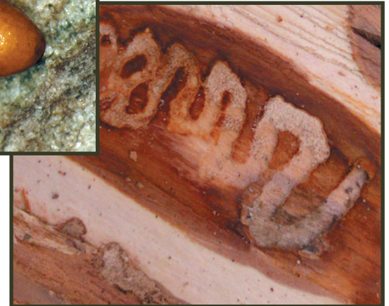
Figure 5. Serpentine tunnel created by emerald ash borer larva