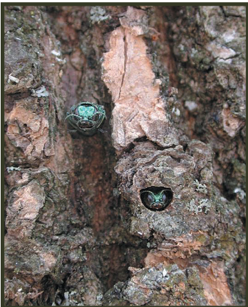
Figure 9. D-shaped emergence hole of emerald ash borer