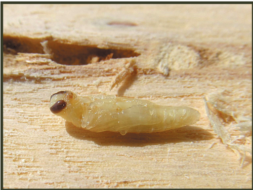
Figure 8. Emerald ash borer pupa

As the beetle within develops, the pupa takes on the adult form. When the adult emerges, the pupal exuvia (shed skin) remains in the pupal chamber. By contrast, two other common ash-boring insects, ash/lilac borer ( Podosesia syringae ) and carpenterworm ( Prionoxystus robiniae ), have the pupal skin partially or mostly extruded from the adult exit hole. Buprestids of the genus Agriilus , such as EAB, leave D-shaped emergence holes (Figure 9).