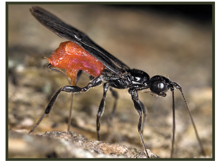
Figure 19. Braconid wasp, Atanycolus cappearti , of emerald ash borer