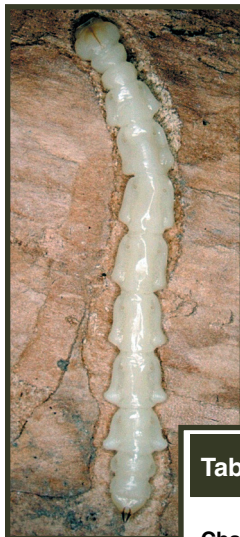
Figure 6. Emerald ash borer larva