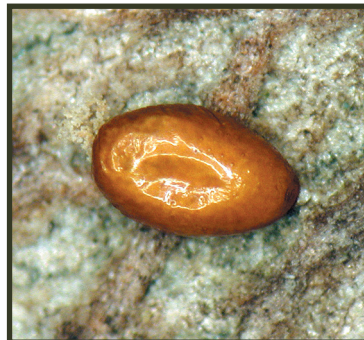
Figure 4. Emerald ash borer egg