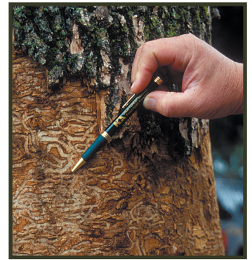
Figure 13. Larval galleries of emerald ash borer

Visible symptoms of damage are dieback of the tree crown (Figure 14) and excessive sprouting (epicormic branches) along the main stem of the tree (Figure 15). However, these symptoms are unlikely to be seen during the first year of infestation. Instead, dieback probably will be observed only in trees that have been infested for three years or longer.