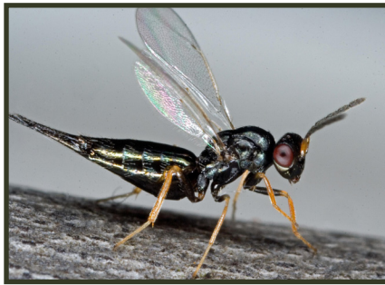
Figure 18. Eulophid wasp, Tetrastichus planipennisi , of emerald ash borer

Parasitism of EAB eggs by O. agrilli was observed to be near 22 percent. For T. planipennisi , larval parasitism was at 20 percent in young ash trees and 50 to 80 percent in ash saplings, and it is spreading rapidly in all EAB-infested parts of North America. Researchers are optimistic that a combination of introduced and native parasitoids will help reduce EAB densities below a tolerance threshold so that ash trees can survive in the forest ecosystem.