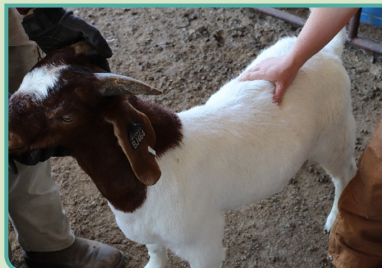
Figure 1. Body condition scoring rams and bucks – manual appraisal.

To achieve target BCS and optimal semen quality prior to the breeding season, rams and bucks in ideal maintenance condition (BCS 2 to 2.5) should be placed on an increasing plane of nutrition six to eight weeks before ram/buck turnout. This includes increasing dry matter intake, energy (TDN) and protein in the diet by 10 to 20%. Increasing dietary energy is commonly accomplished through cereal grain (e.g., corn, oats) supplementation at 0.5 to 1.5lb/head/day, depending on mature ram/buck size (Tables 1 and 2). Moreover, forage alone is generally insufficient in meeting the 18% increase in protein