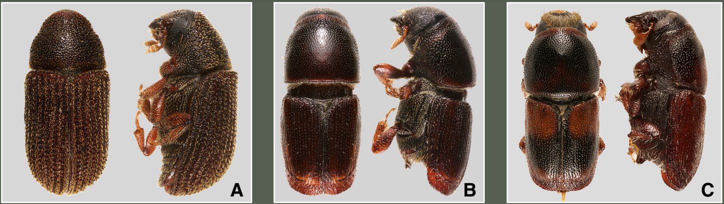
Figure 1. The three species of bark beetle found in North Dakota that spread DED: (A) native elm bark beetle— Hylurgopinus rufipes , (B) smaller European elm bark beetle — Scolytus multistriatus and (C) banded elm bark beetle — Scolytus schevyrewi .