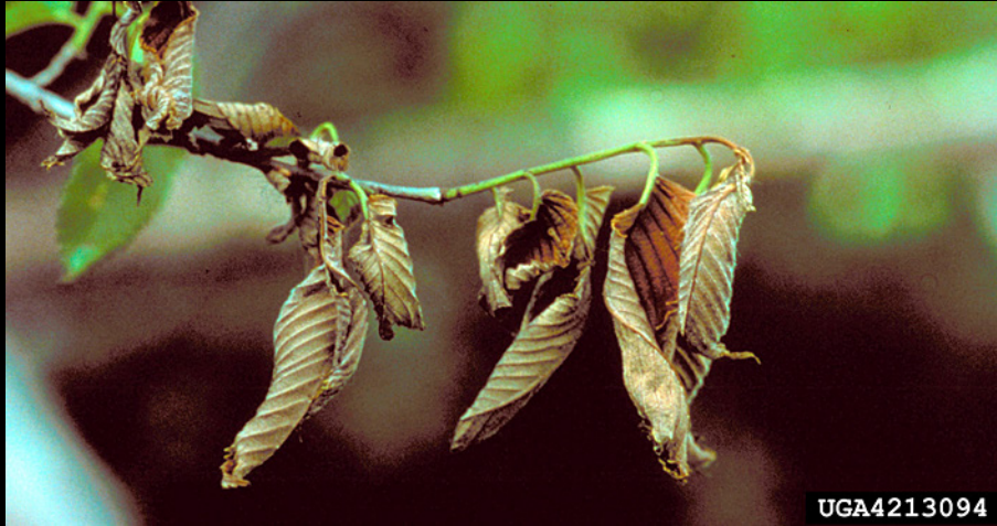
▲ Figure 2. Wilting leaves on a flag branch is a characteristic symptom of DED.