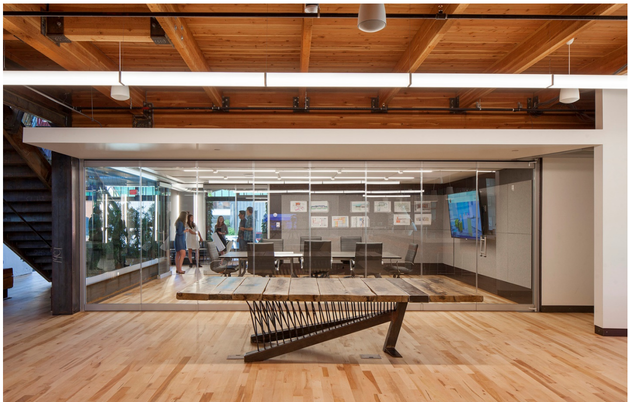
CTA Office – Billings, Montana