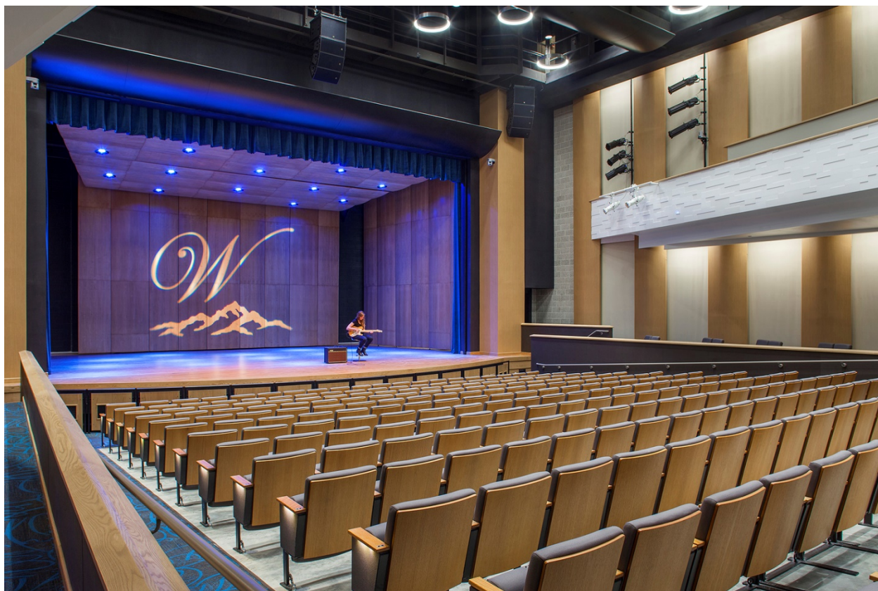
Whitney Center for the Arts – Sheridan, WY