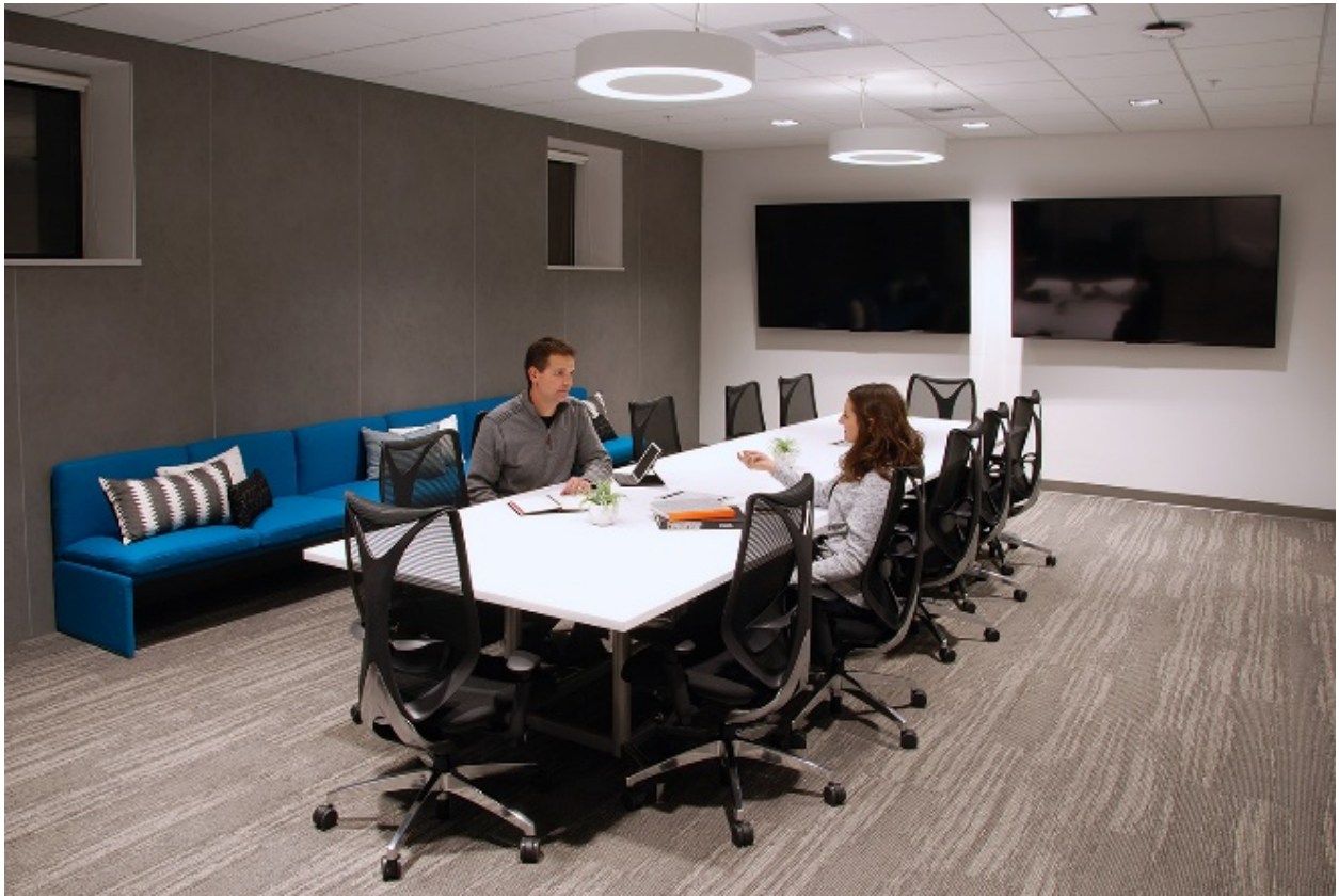
SoFi – Helena, MT