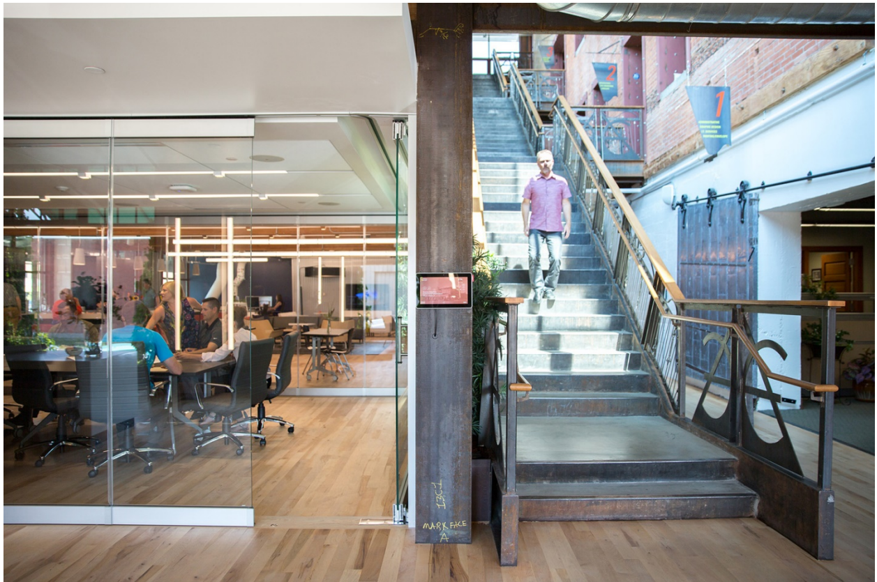
CTA Office – Billings, Montana