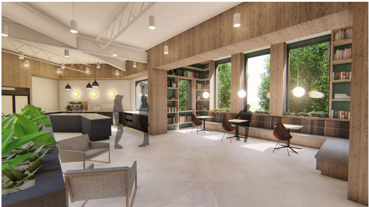
Confidential Client – California