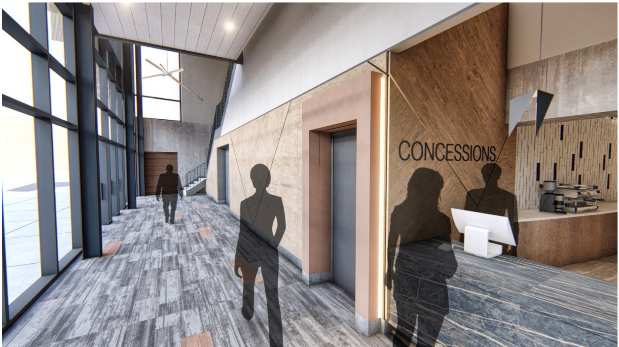
Alberta Bair Theater – Billings, Montana