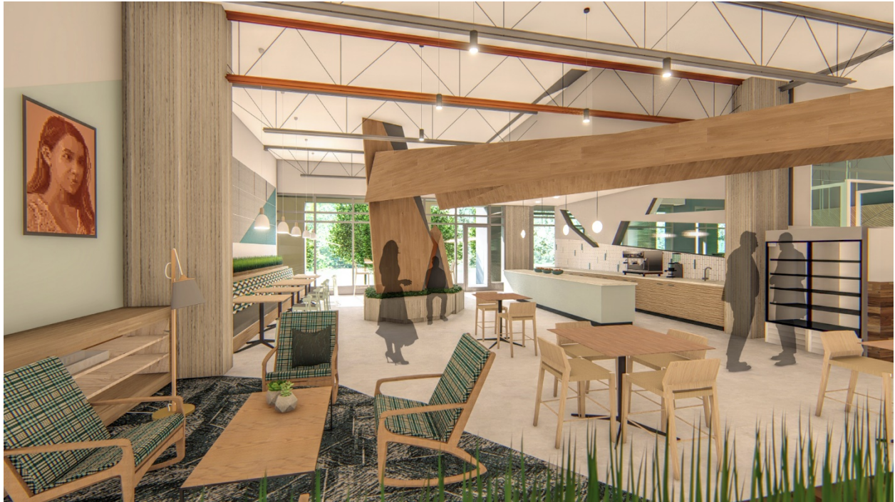
Confidential Client – California

This project encompassed a tenant improvement of three buildings on campus, each representing water in three various states – fluid, solid, and mist.