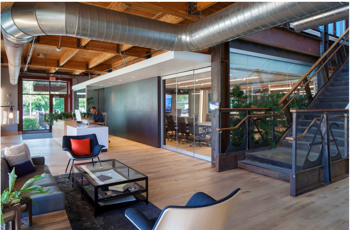
CTA Office – Billings, Montana