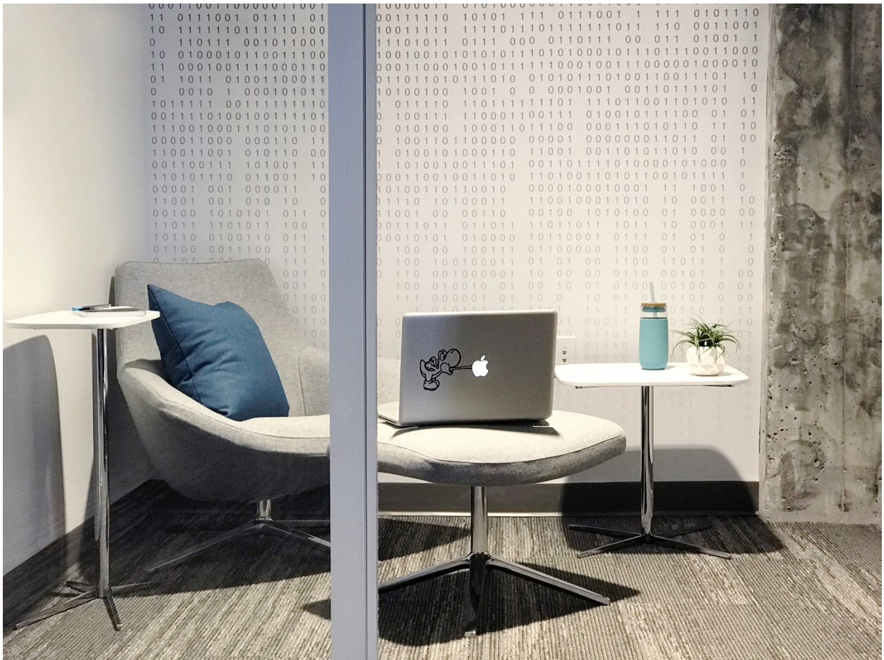
SoFi – Helena, MT