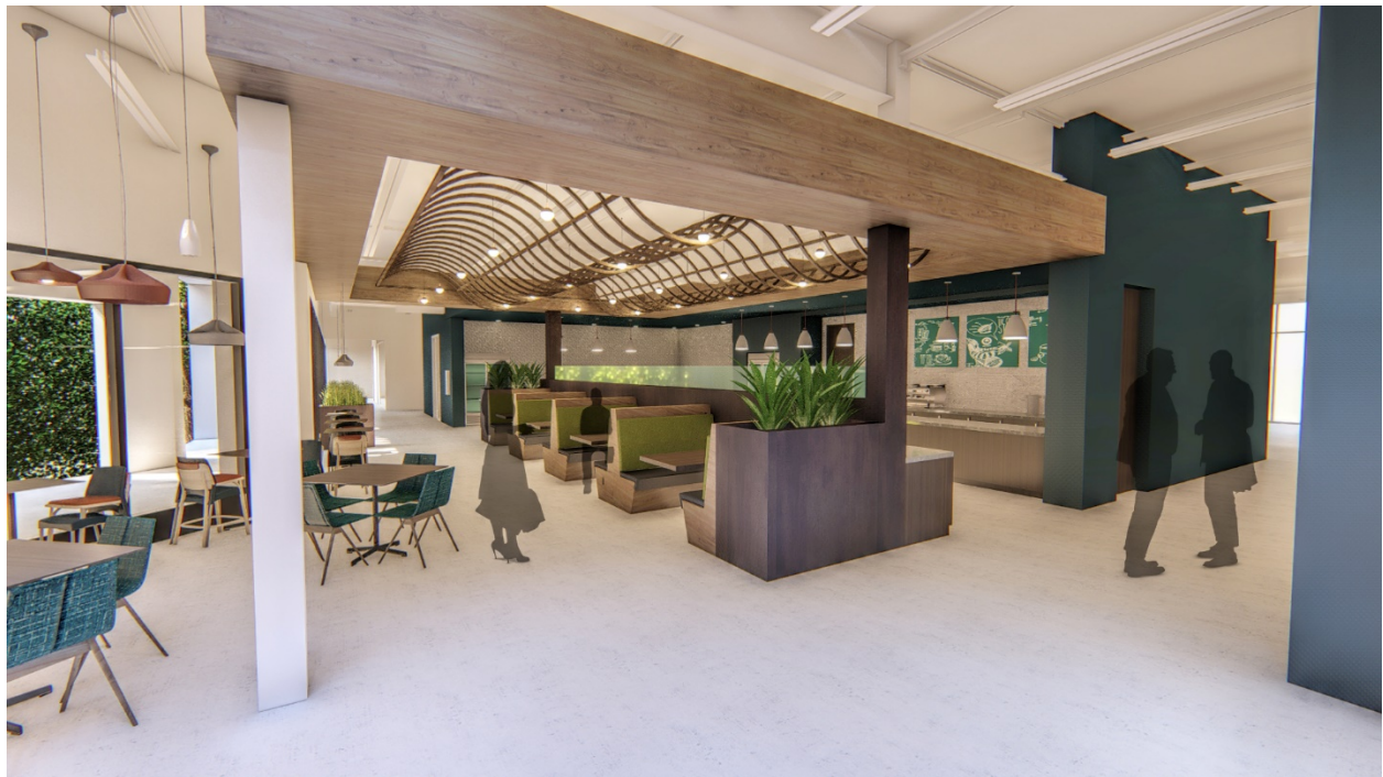
Confidential Client – California