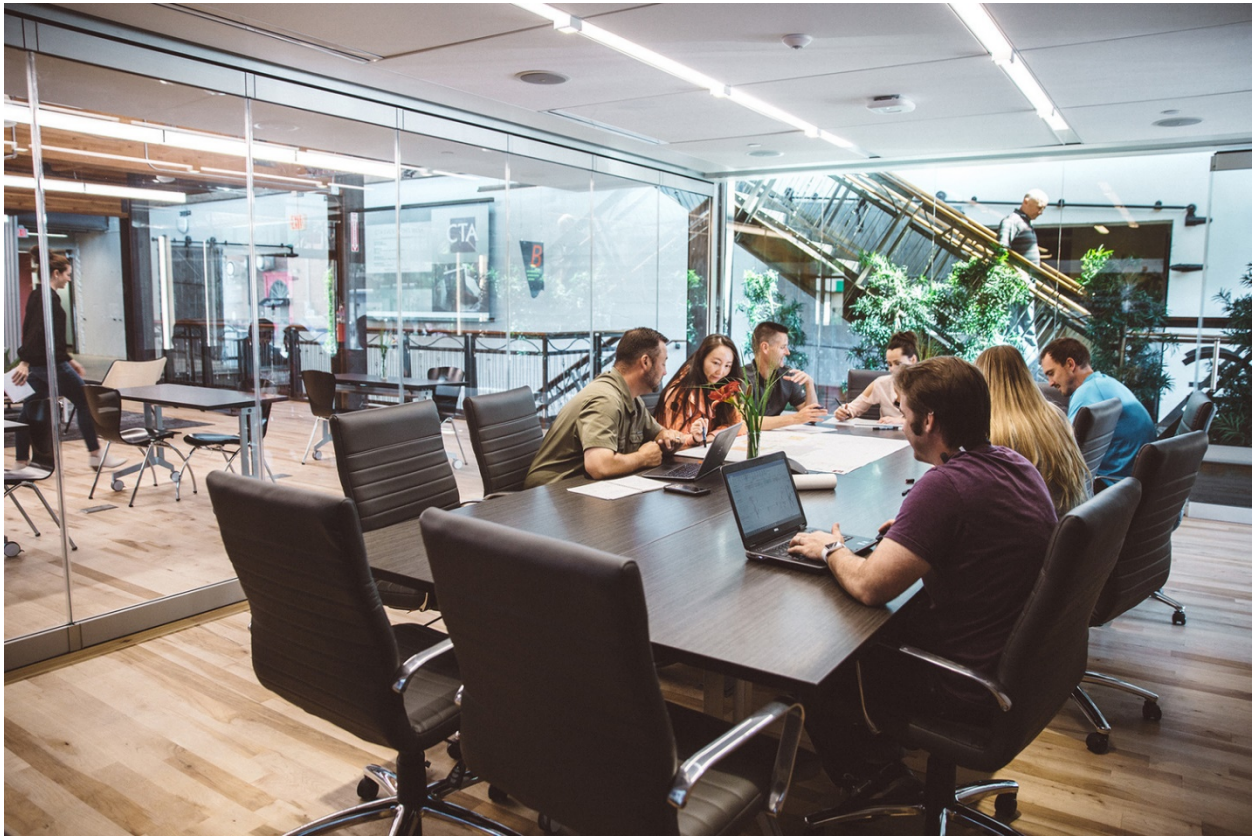
CTA Office – Billings, Montana