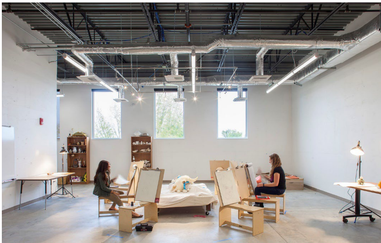
Whitney Center for the Arts – Sheridan, WY