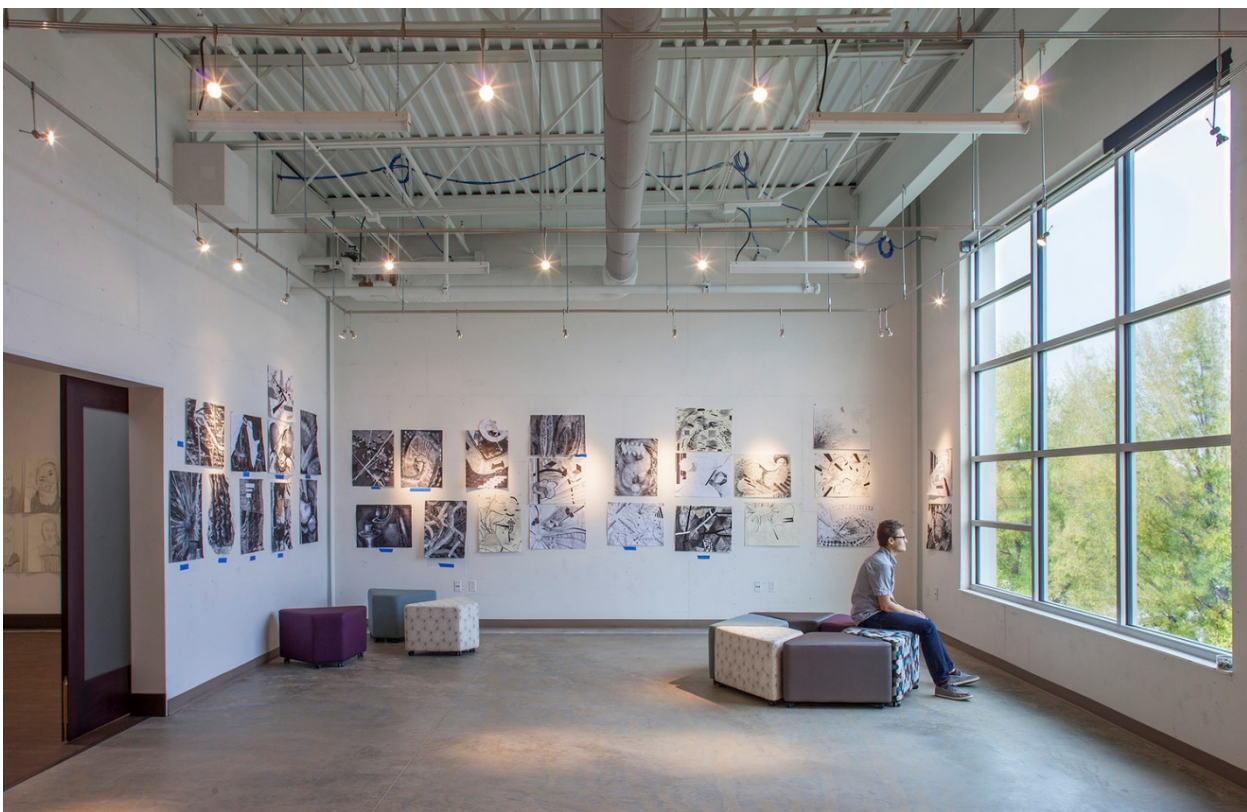
Whitney Center for the Arts – Sheridan, WY