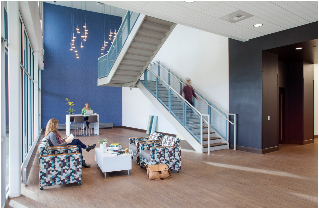
Whitney Center for the Arts – Sheridan, WY

A renovation of an outdated gym and presentation hall reprogrammed to accommodate art studios and workshops, art galleries, music practice rooms, and a 422 seat concert hall.