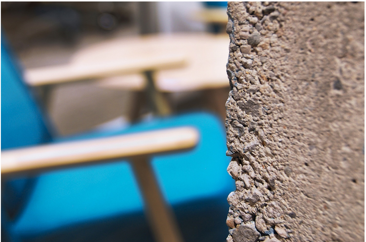
SoFi – Helena, MT