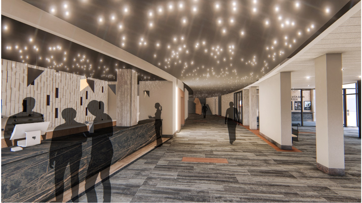
Alberta Bair Theater – Billings, Montana