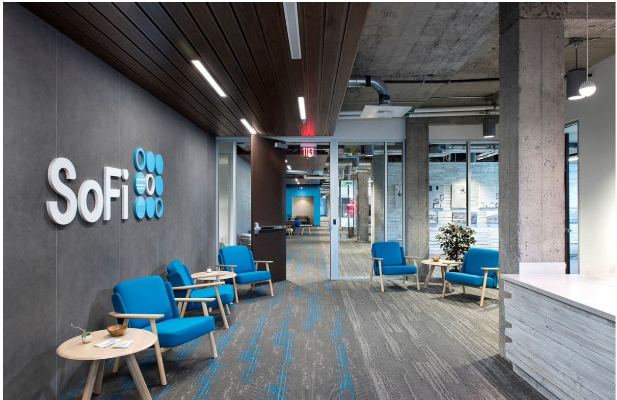
SoFi – Helena, MT

A tenant improvement project for a tech startup company based out of San Francisco, California