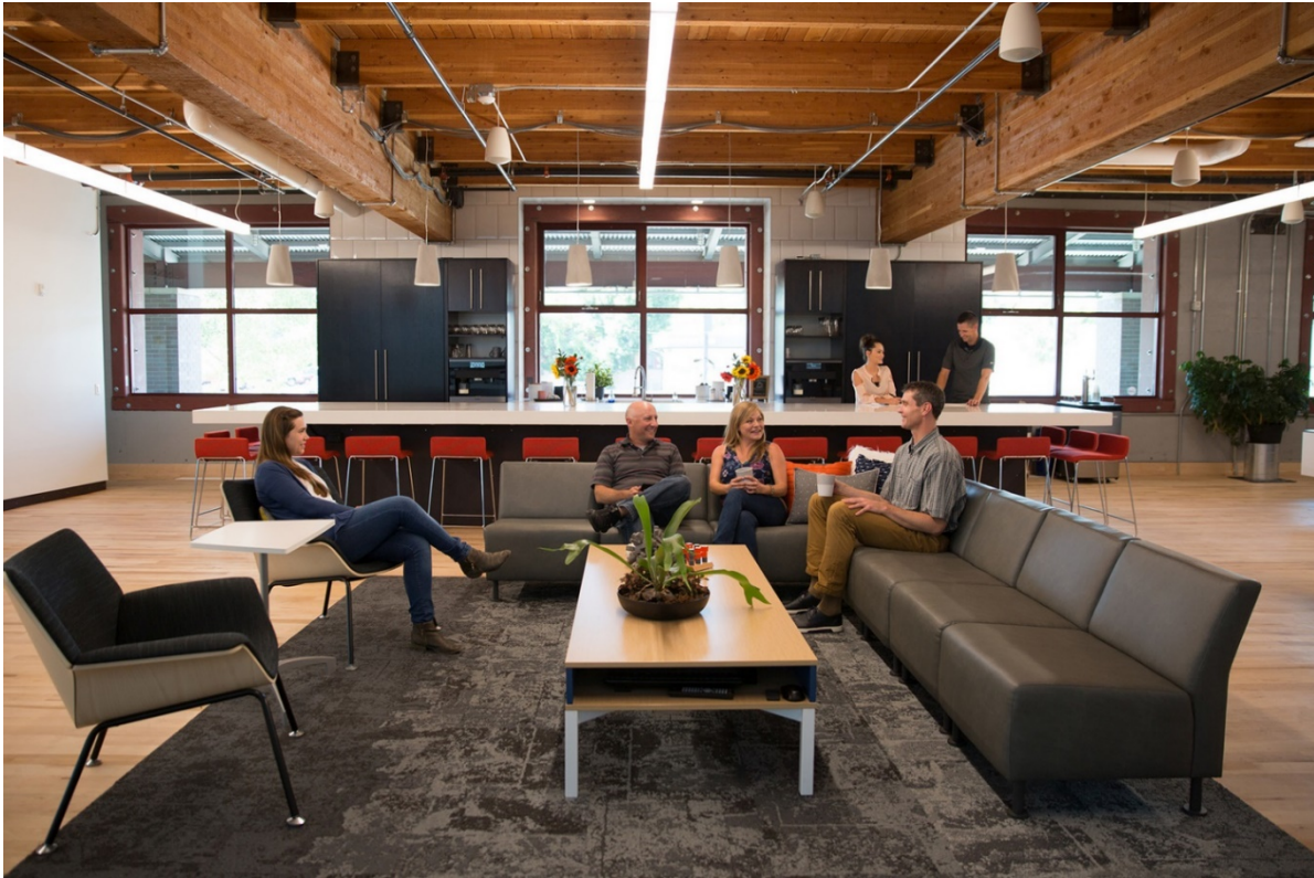
CTA Office – Billings, Montana

A LEED Gold certified adaptive reuse of a 1921 Marshall Wells warehouse office remodel for CTA Billings employees.