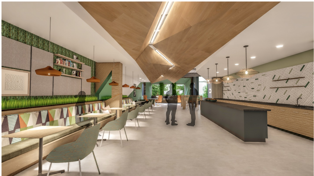
Confidential Client – California