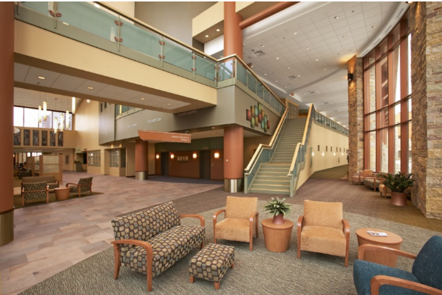
Maple Grove Medical Campus, Outpatient Facilities