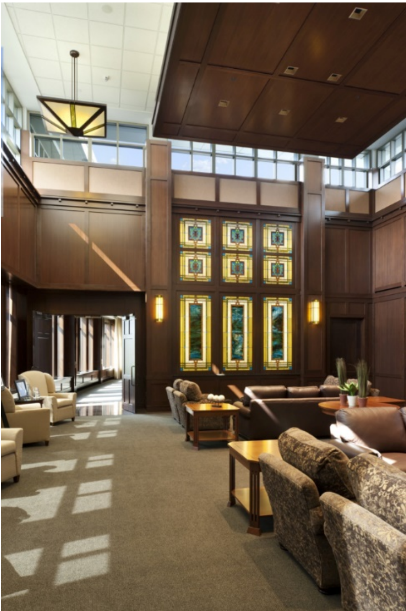
Federated Insurance South Campus