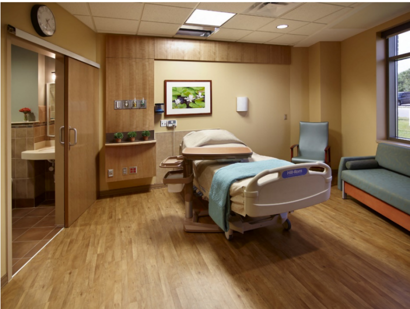
Chippewa County Montevideo Hospital Patient Room Headwall