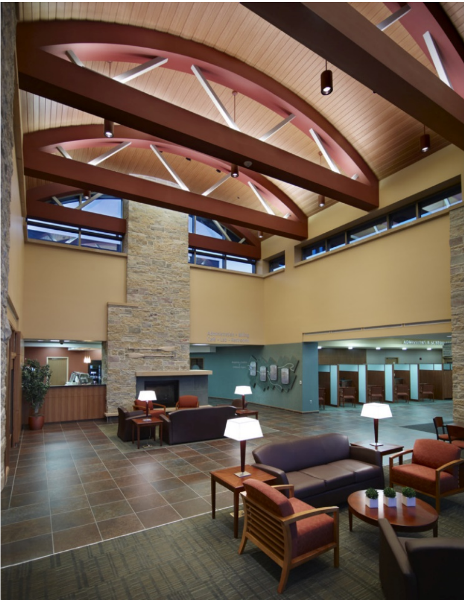
Chippewa County Montevideo Hospital Main Lobby