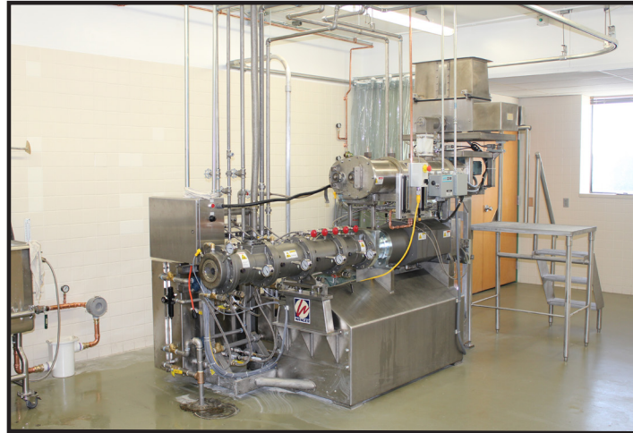
Wenger TX-52 Twin-Screw Extruder

The Northern Crops Institute staff employs twin-screw technology to provide client-