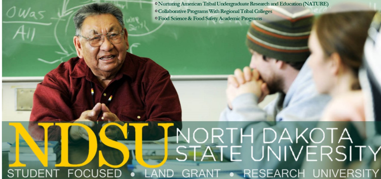
The half page ad featuring NDSU in the 'Winds of Change' Magazine