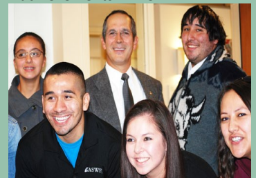
Astronaut John Herrington, rear center, meeting with students

Herrington's journey has been to challenge people to re-think their obstacles and to see their dreams as reality. For many his story has done just that. Be inspired by this hero's tale of twists and turns and learn what he attributes as having been critical to his achievements in life.