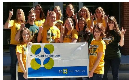
Be the Match

We demonstrate volunteerism through serving underserved populations at Churches United for the Homeless, where we prepare and serve meals. New this year is the development of the Intellectual Auction. Items and experiences in this auction have been carefully selected, creatively planned,