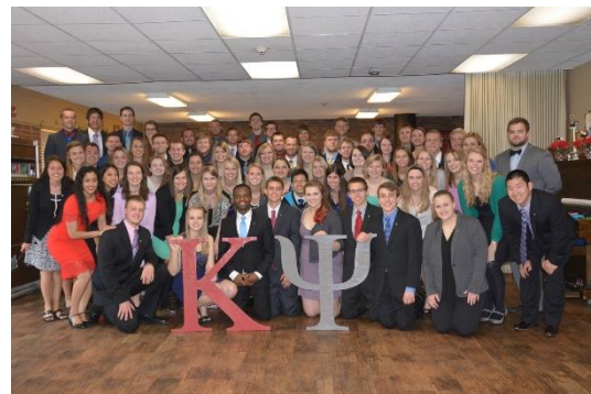
Kappa Psi members

Kappa Psi has opportunities extending far past college; it truly is a brotherhood for life. This past August, 11 brothers traveled to Denver, Colorado for our national Grand Council Convention. It was a wonderful time to network with other chapters and alumni from around the country and get a sense of everything this fraternity has to offer.