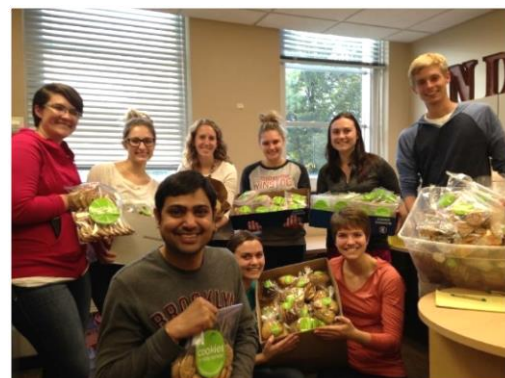
Packaging cookies for our first "Cookies for Kids' Cancer" cookie sale

This September, we invited all other student organizations within the College to join us in hosting a cookie sale to draw attention to Pediatric Cancer Awareness Month. Many of the organizations donated LOTS of cookies...we ended up packaging over 100 dozen to sell! Our 2-day cookie sale raised over $1,200 for "Cookies for Kids' Cancer," an organization that supports pediatric cancer research across the country. We are excited to see how the event grows and expands next year! Additionally, a few Ambassadors also had the chance to visit several delightful kids at Sanford Children's Hospital. We are happy to now have little "Honorary Ambassadors!"