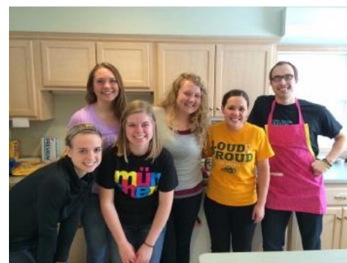
Members cooking a meal at the Ronald McDonald House.