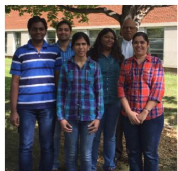
AAPS-NDSU Student Chapter Office Bearers 2015-2016

Our mission is to recognize leaders and foster leadership development.