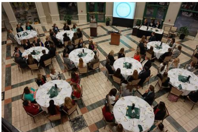
PLS 2015 Etiquette Dinner

PLS is planning to prepare brochures about OTC medication for international students. The brochures will have information about different OTC medications and the indications in different languages for students to read, which will help international students to find the right treatments.