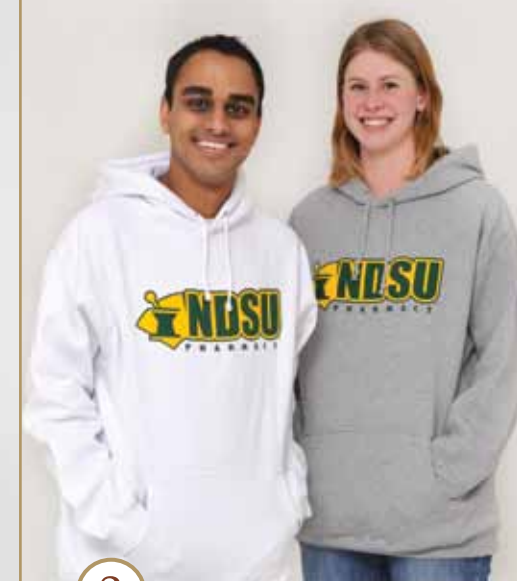
2 NDSU Pharmacy hooded sweatshirt