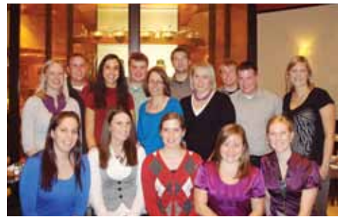
Students attended the ASHP Midyear Meeting in Las Vegas in December 2009.

NDSU's chapter of the Student Societies of Health-System Pharmacy has received recognition from the American Society of Health-System Pharmacists. This is the first time the group has received official recognition.