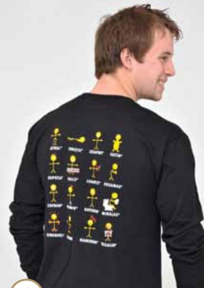
1 NDSU Pharmacy long sleeve T-shirt

Your purchase supports NDSU's chapter of the Academy of Students of Pharmacy.