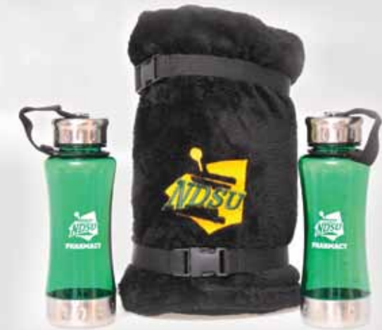
3 NDSU Pharmacy blanket