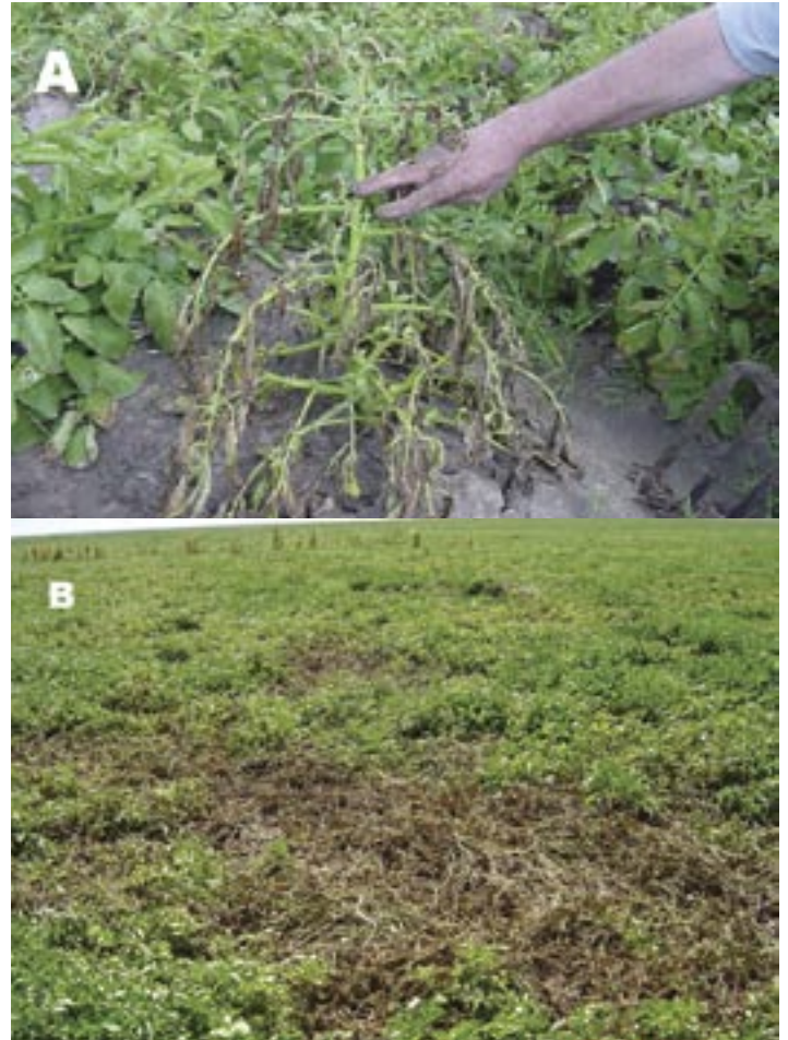
Figure 1: Foliar symptoms of “zebra chip” in potato. Scorching of leaves of an individual plant (top) and an area in a field with collapsing plants that die early (bottom).

ZC continues to be economically important in the fresh and processing potato producing areas of Mexico, particularly in the states of Coahuila and Nuevo Leon in northeastern Mexico, where it is called “papa manchada” (stained potato). In 2004, ZC incidence in this region was as high as 80% in some fields. This area borders the winter potato production area in TX where ZC was found in the USA. The disease is also serious in potato production areas of Guatemala, where it is named “papa rayada” (striped potato), and causes a serious problem of market potatoes, subsis-