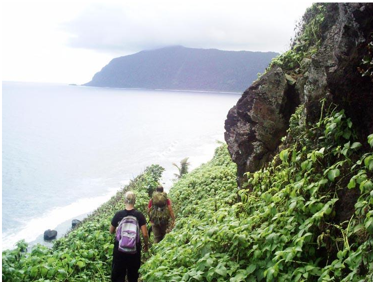
Photo: Surveying at the NDSU Archaeological Field School in Samoa

Field schools and internships can be done for academic credit – see your advisor.