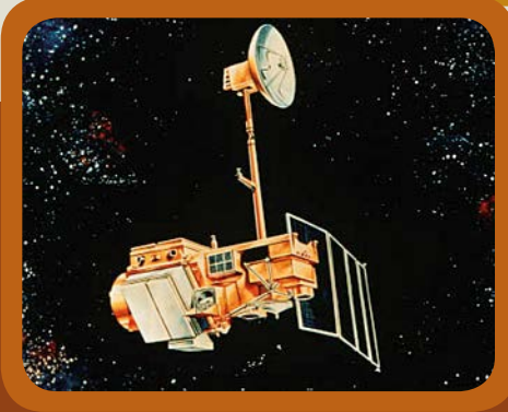
Landsat 5 satellite.