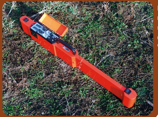
Electromagnetic soil sensor.