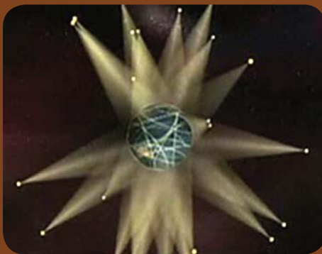
Global Positioning Satellite system satellite array around Earth.

GPS (global positioning satellite) receivers are becoming so common that they are a part of everyday life for many Americans. Hunters and fishermen use GPS receivers. GPS receivers are in rental cars, in our own cars, in cell phones, wrist watches and golf carts. The GPS signal is part of the "peace dividend" from the end of the Cold War. The U.S. Department of Defense has a system of satellites in geosynchronous orbit around the Earth that transmits signals to any receiver designed to analyze the signal. Combined with a very accurate time measurement within the satellite, the receiver on Earth can determine its location