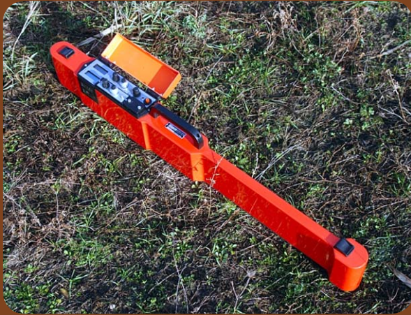
Electro-magnetic soil sensor.