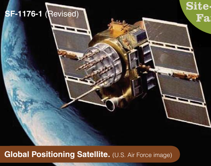
Global Positioning Satellite.