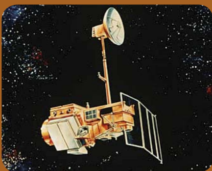
Landsat 5 satellite.