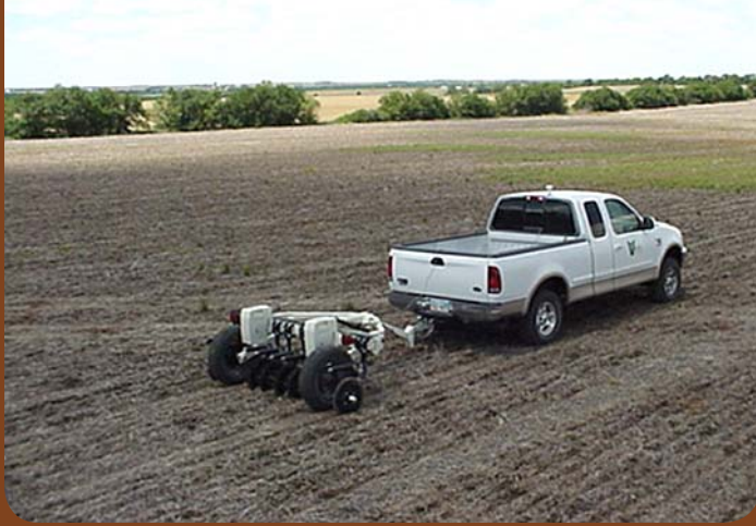
Electrical conductivity soil sensor.